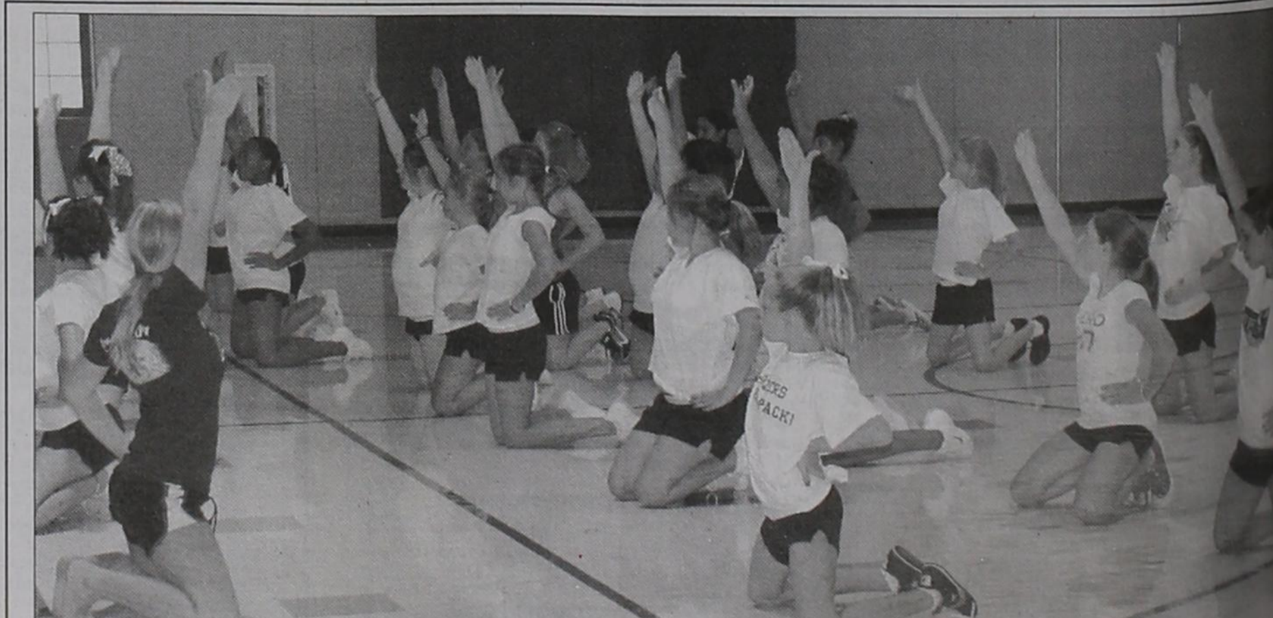
When Utley Middle School opens its doors this fall as the third Rockwall middle school, everything will be new - including the sports and the squads that cheer for them. The newly formed Utley Middle School cheerleading team spent a week with the Rockwall High and Rockwall-Heath High School cheerleading squads learning cheers, chants, jumps, new techniques and a spirit dance to be performed basketball games. Here the Utley cheerleaders learn the details of their spirit dance, even down to thumb placement and leg angles, from Rockwall-Heath cheerleaders. Utley will open its doors to seventh graders when the 2009-2010 school year begins on Monday, Aug. 24.

The Health Center is located in the Reeves Service Center, 102 S. First St., Suite B, on the lower level. For more details or to make an appointment, call 972-772-8194.