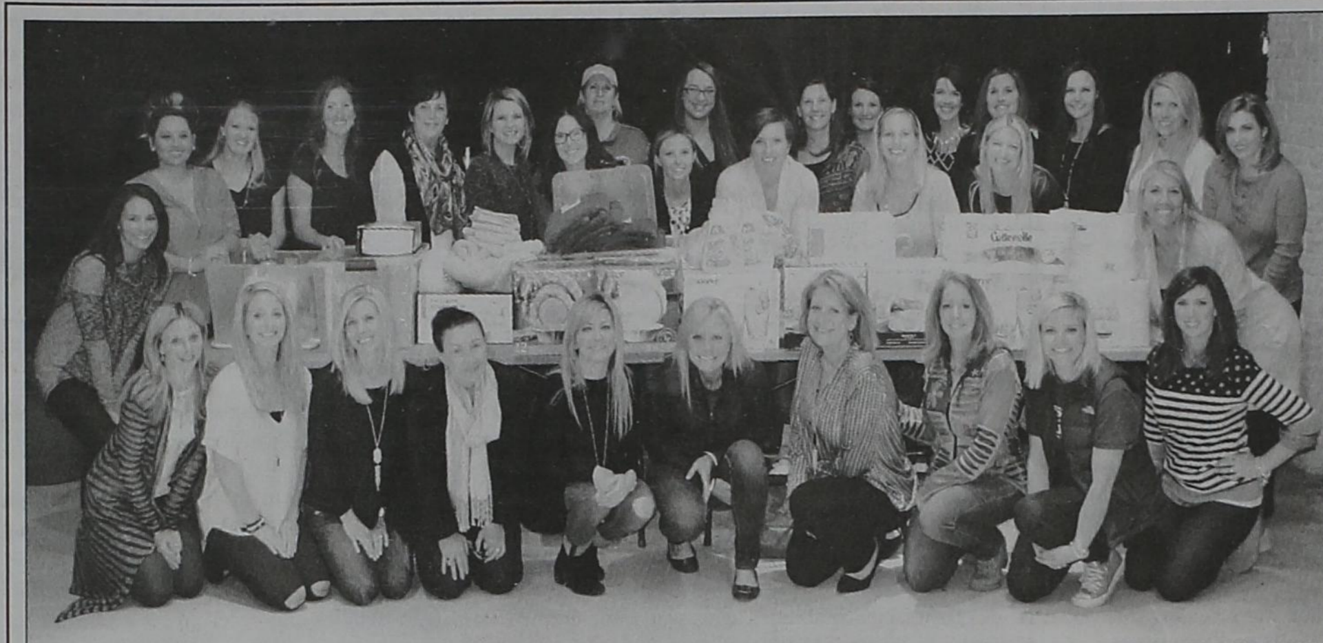
Members of the Aspasians, pictured above, recently delivered new household goods to the Rowlett Tornado Relief Donation Center. Donations included new sheet sets, towels, dishes and cookware sets to help the affected families. The donations were collected at the organization's February meeting, dubbed "For the Love of the Community," and delivered to the Tornado Relief Center on Saturday morning. For more information about Aspasians, visit aspasians.com .