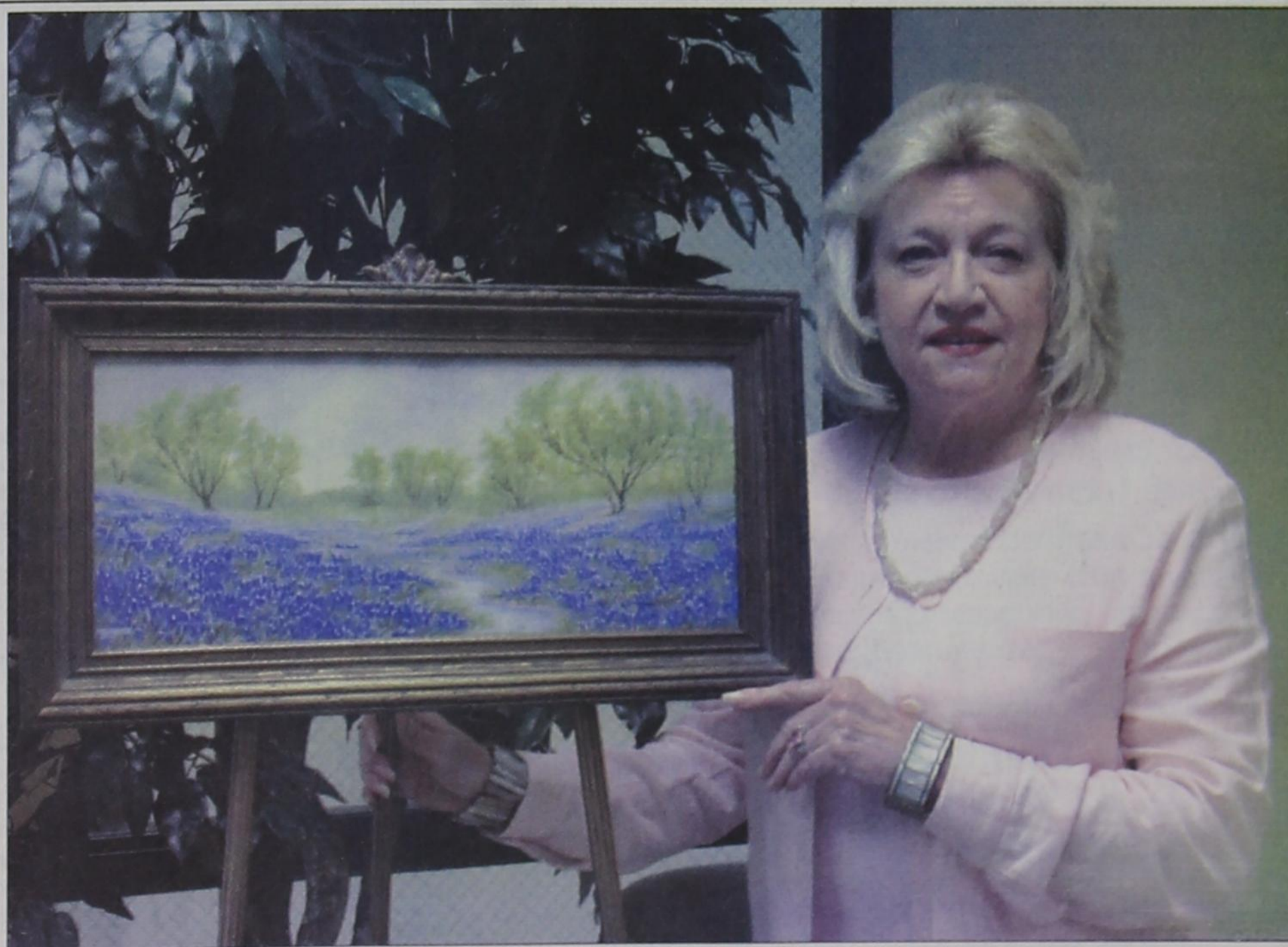
Special Art for Rockwall Alliance for the Arts

The year's gala is scheduled for Saturday, Oct. 17 at the Hilton Hotel in Dallas. For more information visit www.rockwallarts.org .