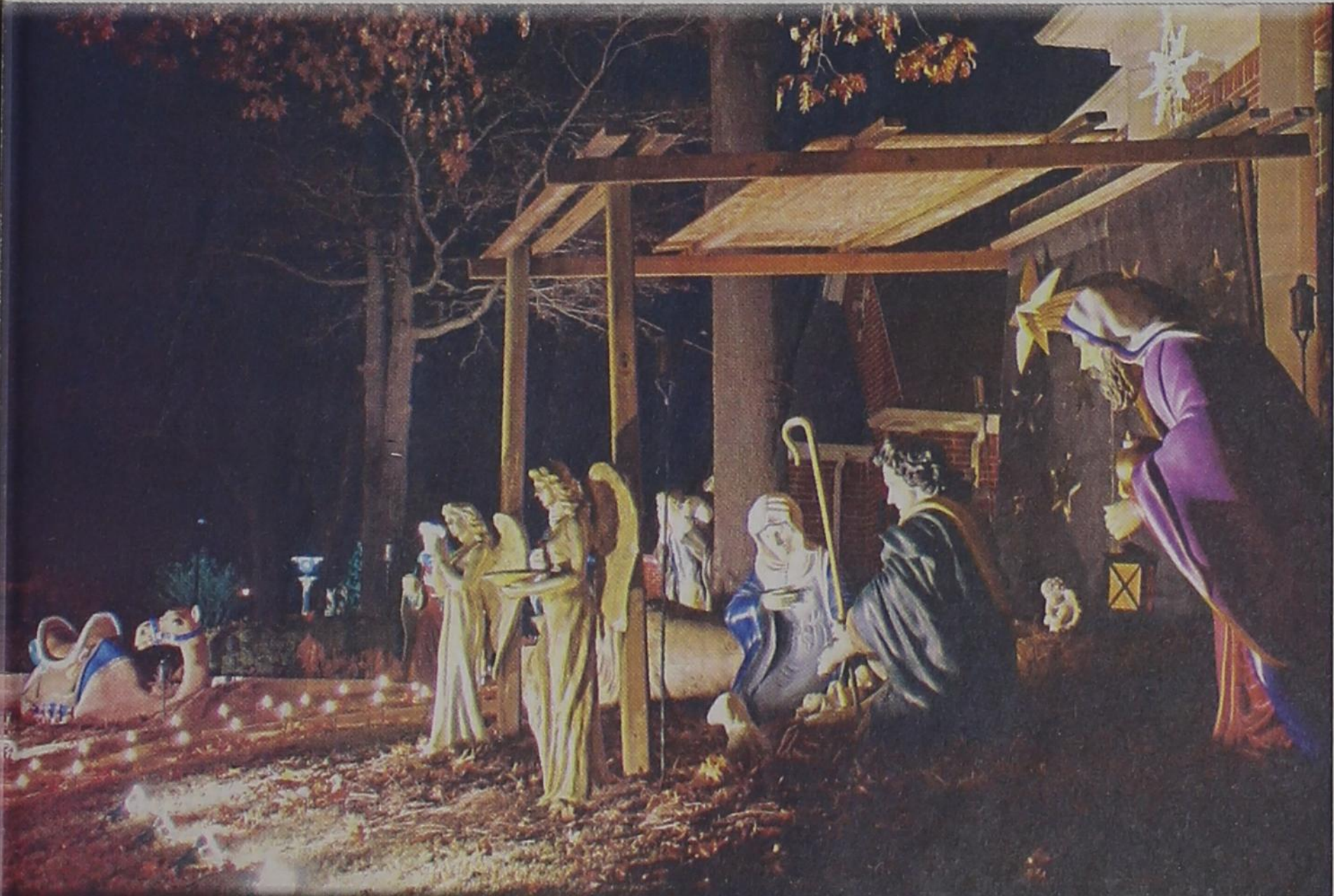
This life-size nativity scene can be found on Racheal Drive in Heath. At back, viewers will see a Santa sitting and reading a Bible.

Also, a rate increase of 21 cents per month for residential customers was approved by the city following a request from its garbage and recycling collection provider, Republic Waste Services. The new rate will go into effect in January and will be reflected in February utility bills, according to the newsletter.