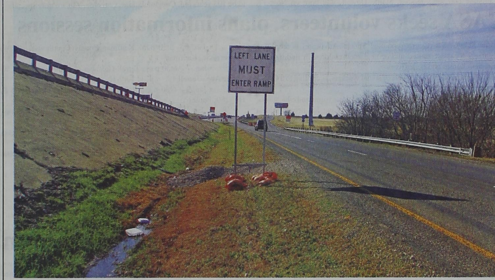
This is one of several dangerous sections of the Erby Campbell Construction Project on I-30 in Royse City. The photo shows the two westbound lanes of the service road just past McDonalds (not pictured, but on the right). Drivers wishing to get onto the interstate must take the left lane as the sign indicates, and the danger comes when the two lanes of traffic are coming over the underpass at FM 548 and down the hill into traffic trying to merge onto the interstate. This leaves oncoming vehicles little time to get into the flow of traffic. Where the automobile is seen in this photo is where the service road splits. Traffic in the right-hand lane will continue one way on the service road until Fate Exit FM 551, then the driver may choose to continue on the service road or enter the interstate. Travelers are advised to read and obey all the traffic signs, especially the speed limit signs, not only to the interstate but on the service roads as well.