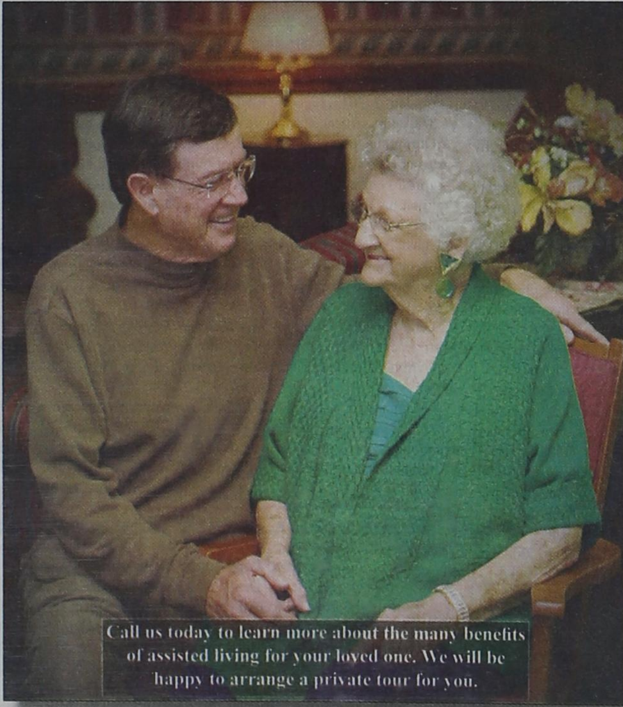
Call us today to learn more about the many benefits of assisted living for your loved one. We will be happy to arrange a private tour for you.