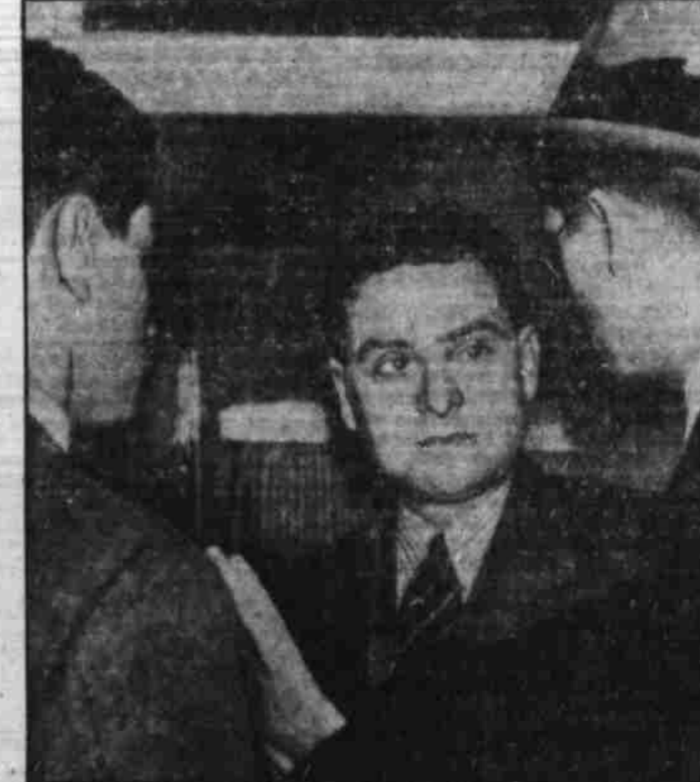
Homer Martin, president of the United Auto Workers Union, is shown talking to reporters as he emerged from the strike conference room at Detroit to get his glasses. He brought no word of settlement. Meanwhile, "reserve police" mobilized for action at Flint, seat of the strike.