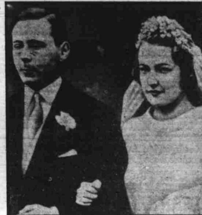
The Duke of Norfolk and his bride, the former Lavinia Strutt, 20, are shown as they left the Brompton Oratory at London after their wedding. The Duke is premier Earl of England and senior peer of the realm.