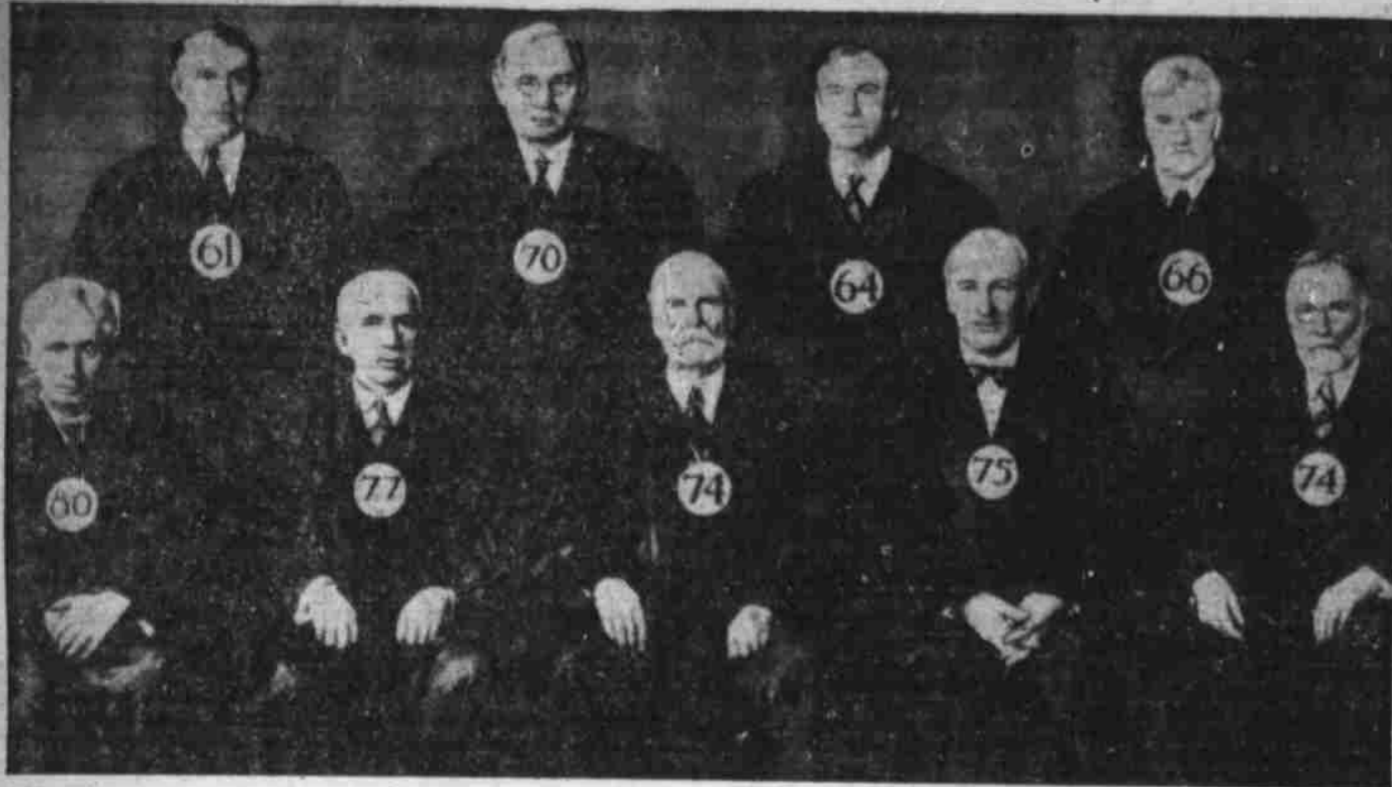
This picture, made when Benjamin N. Cardozo was named to the supreme court, shows the nine members of the high tribunal, with their respective ages indicated in the circles. The president seeks to increase membership to a maximum of 15 by appointing additional justices for all those who do not retire at 70. Front row, left to right: Roberts, Butler, Stone, Cardozo.