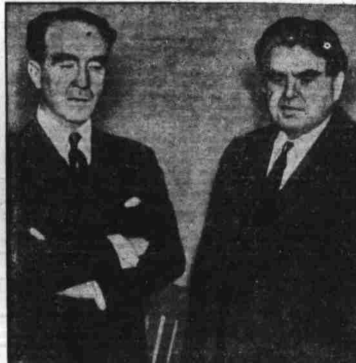
Gov. Frank Murphy (left), of Michigan, and John L. Lewis, chairman of the C. I. O. are shown in Detroit as they met following the first conference with General Motors officials in an attempt to iron out differences over settlement of sit-down strikes.