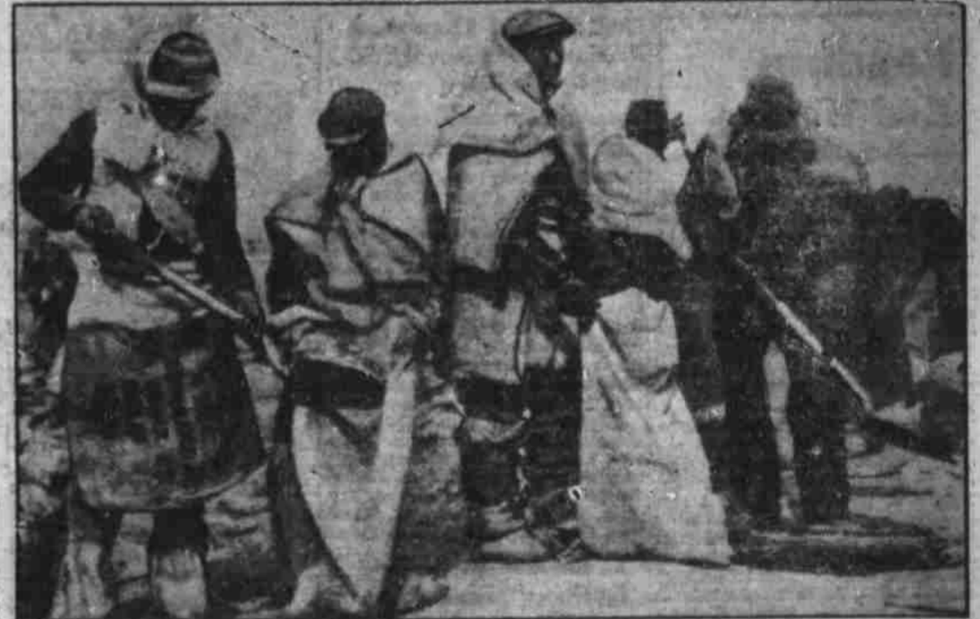
Chilled by wet clothing and low temperatures, these Negro workers on a Melwood, Ark., levee wrapped themselves in burlap bags—the same bags they might have used to fill with earth and dump on the levee.