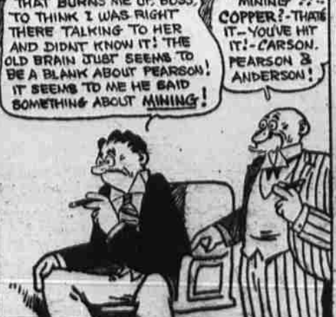
THAT'S BUST IT! THAT HE MENTIONED WHAT BUSINESS HE WAS IN. I GOT THE IMPRESSION HE WAS RETIRED!