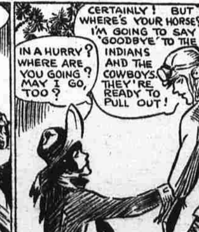
U. & Patent Office ALL RIGHT, BUT MAKE IT SNAPPY, I'M IN A