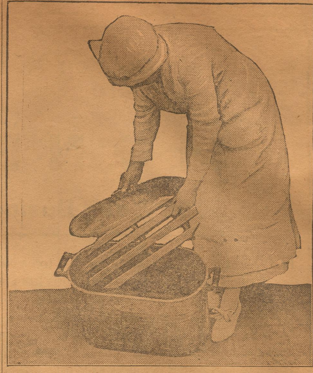
Homemade Hot Water Bath Sterilizing Outfit, Showing Satisfactory Type of Wooden False Bottom.

Time Table for Scalding Blanching, and Sterilizing Vegetables, Soups, Fruits, and Meats.