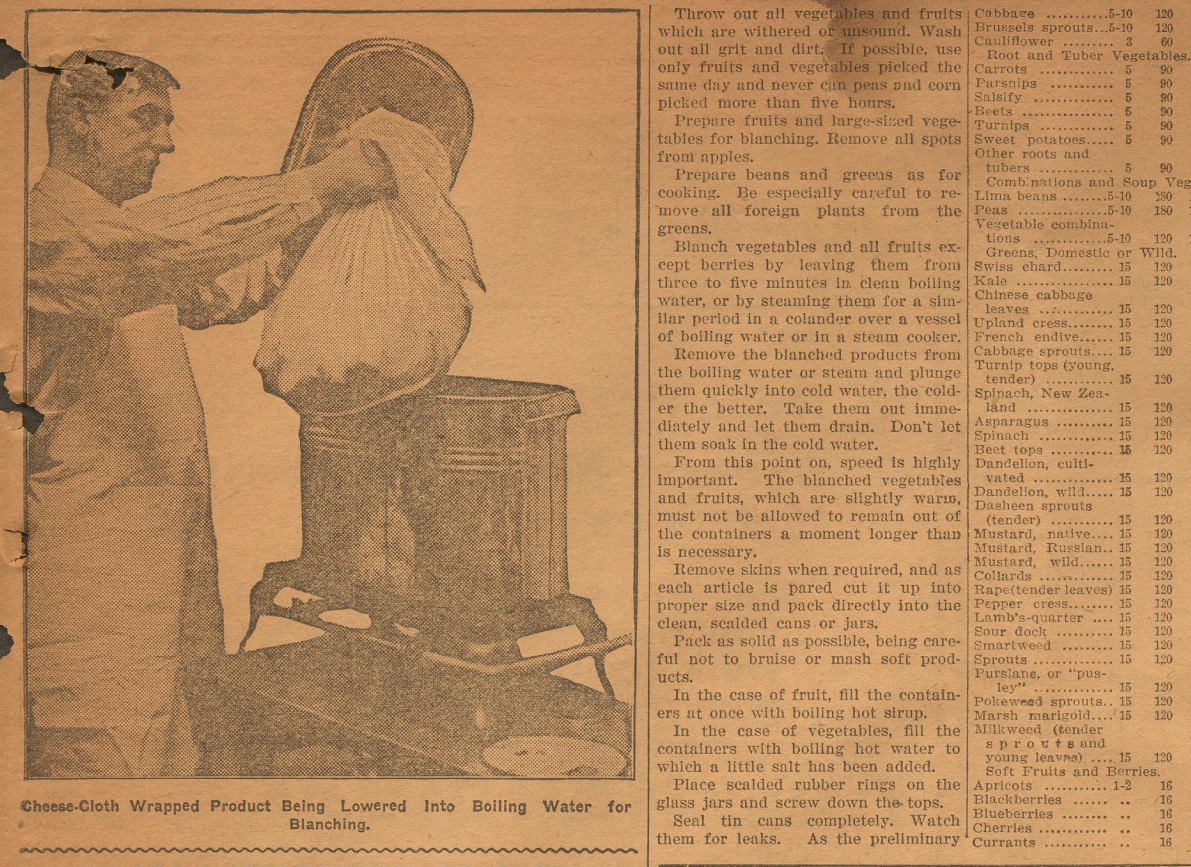
Cheese-Cloth Wrapped Product Being Lowered Into Boiling Water for Blanching.