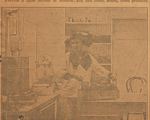
estere Cooker Also

making certain that there are no leaks, swellings or other signs of fermentation. There will be no spoilage if the directions are followed implicitly and the containers are sealed up tight. Fruits which are put up with heavy sirups can be kept under cork and paraffin seal, Save all wide-necked bottles, glasses and jars for putting up fruits. Vegetables, meats, and fish, however, cannot be kept safely unless they are hermetically sealed. Reserve regular jars for products that cannot be packed in other ways. As there may be some difficulty in securing cans and jars, dry or keep in other ways everything that need not be canned. The labeling should be done with a rather dry paste, which is put only on the end of the label, so that it does not touch the tin. Paste may cause rust, and in damp climates it is sometimes customary to lacquer the outside of the can before it is labeled. The label, if the product is intended for sale, must contain the net weight in pounds and ounces and the packer's name and address. In packing fruits and vegetables, it is necessary to surround them with brine, sirup or water, but under the terms of the federal law governing the interstate shipment of canned goods, no more of this liquor is allowed than is actually necessary to cover the contents after as full a pack as possible is made. With tomatoes no water whatever should be added and no tomato