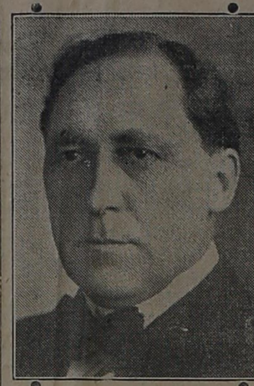
of Waco, Republican Nominee for Governor.

Subscribe for the San Saba AND PERFECT TITLES. SEE Star, $1.00 per year.