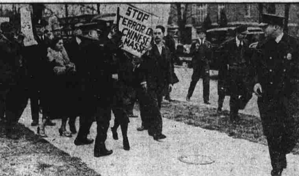
A group of radicals fought Washington, D. C. police in front of the Japanese embassy in a protest against Japanese activities in China.