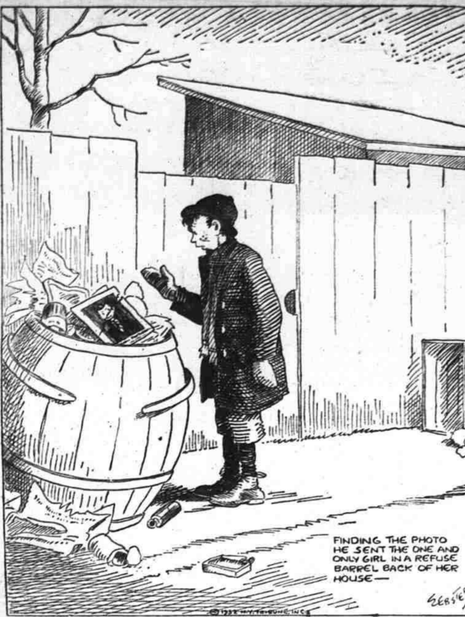
FINDING THE PHOTO HE SENT THE ONE AND ONLY GIRL IN A REFUSE BARREL BACK OF HER HOUSE