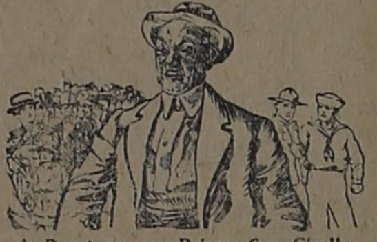
As Dangerous as Poison Gas Shells

in the head, eyes, ears, back or other parts of the body and a feeling of severe sickness. In most of the cases the symptoms disappear after three or four days, the patient then rapidly recovering. Some of the patients, however, develop pneumonia, or inflammation of the ear, or meningitis, and many of these complicated cases die. Whether this so-called 'Spanish' influenza is identical with the epidemics of influenza of earlier years is not yet known.