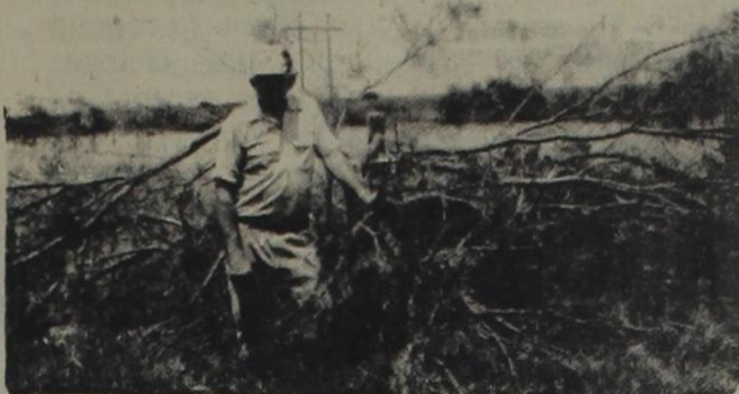
Dr. Dick Hodges shown with a "half-cut" mesquite which will continue to live and provide a living protective canopy for quail. Note the field in the background which is a food plot for wildlife.

technique known as "half-cutting" will improve its value as a quail cover. This modification consists of cutting about half way through the main stems of the plant about 30 to 36 in- ches above ground height and allowing the cut limbs to fall to a horizontal position. Half-cut mesquites in- crease the amount of overhead cover which reduces trampling and disturbance by livestock. "Half-cutting" also provides a protected seed source for desirable plant species and improves quail nesting cover.