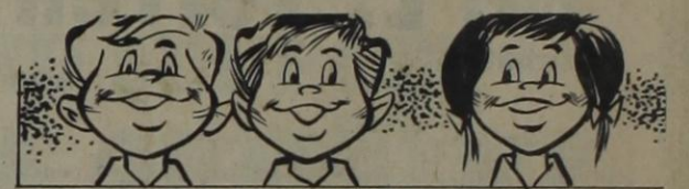
More male than female children are conceived.

MERLE NORMAN The Place for the Custom Face™