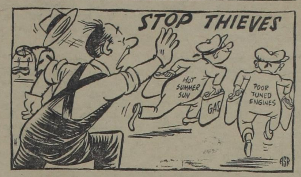
Cut Your Farm Gasoline Bills This Year

Gasoline thieves aren't always human. On many farms the worst culprits are the hot summer sun and poorly-tuned engines. Massey-Ferguson researchers found that six 50-gallon drums standing in the sun lost 30 gallons by evaporation in a month. A vented 290-gallon tank lost 11 gallons.