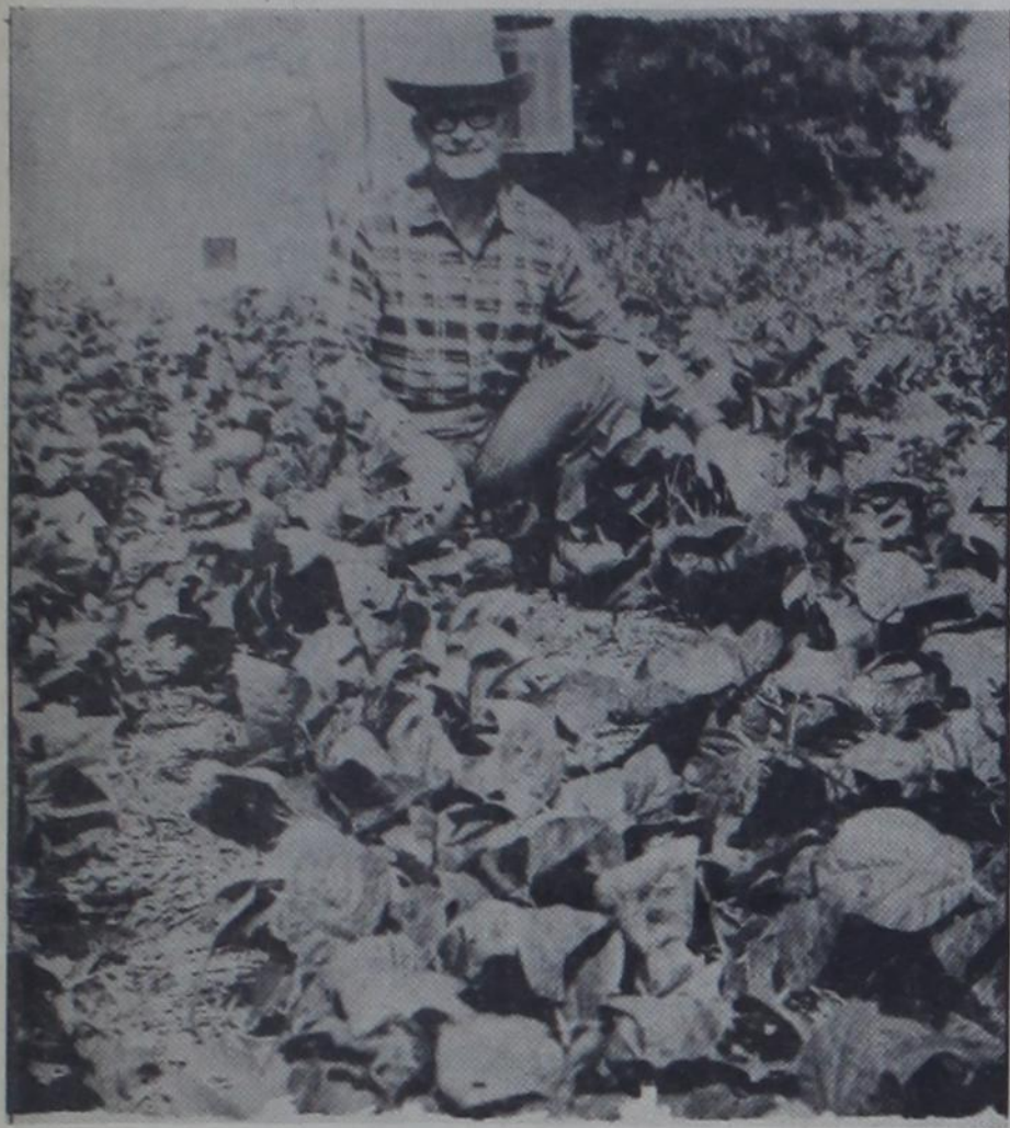
These bean vines have already produced an abundant crop of green beans.