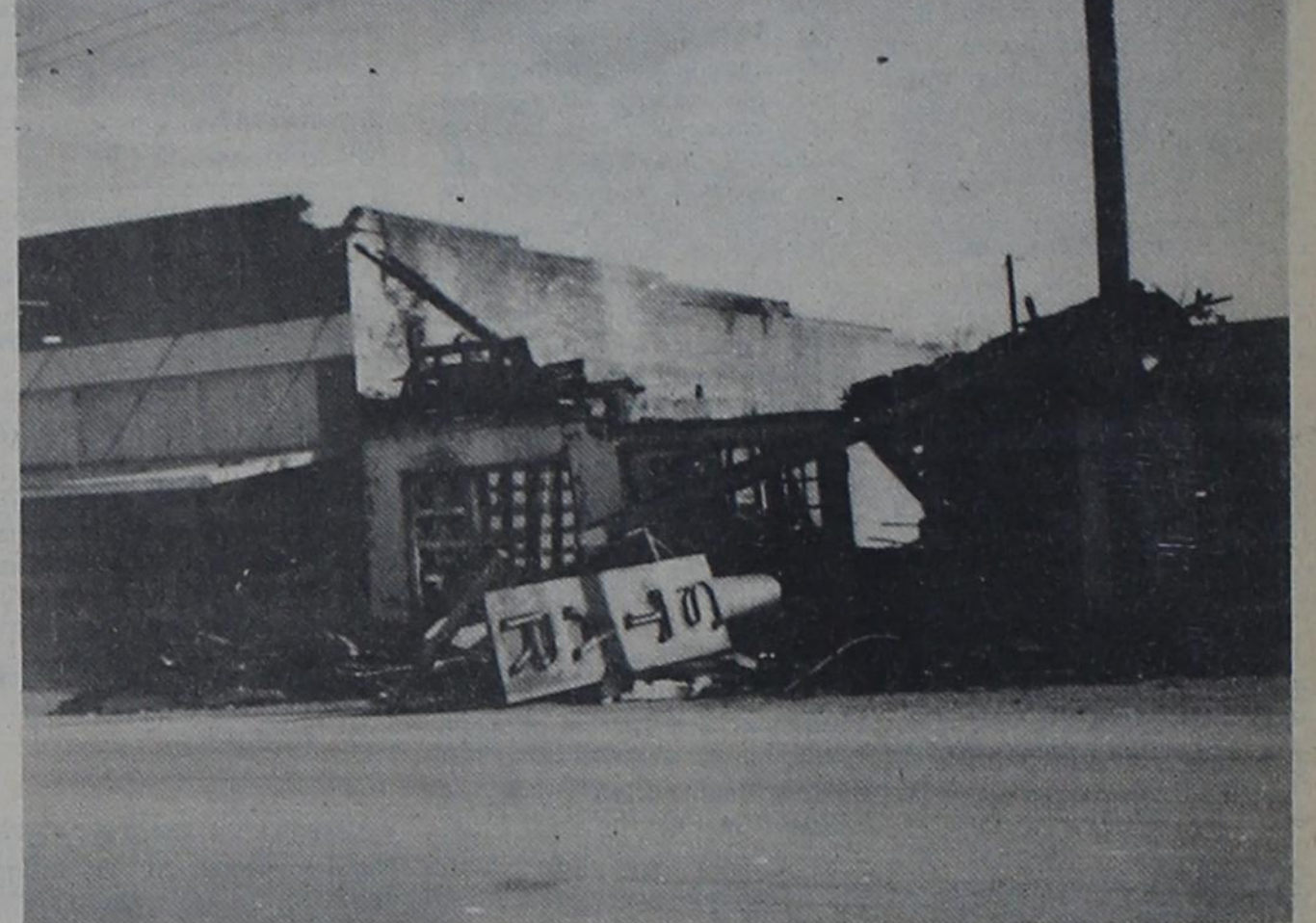
The old Star Theatre building was destroyed by fire on Saturday afternoon.

In making this announcement, the veteran Senator said, "I believe that my re-election will prove to be of the utmost benefit to our District because of my past experience, seniority and knowledge of the needs of our district."