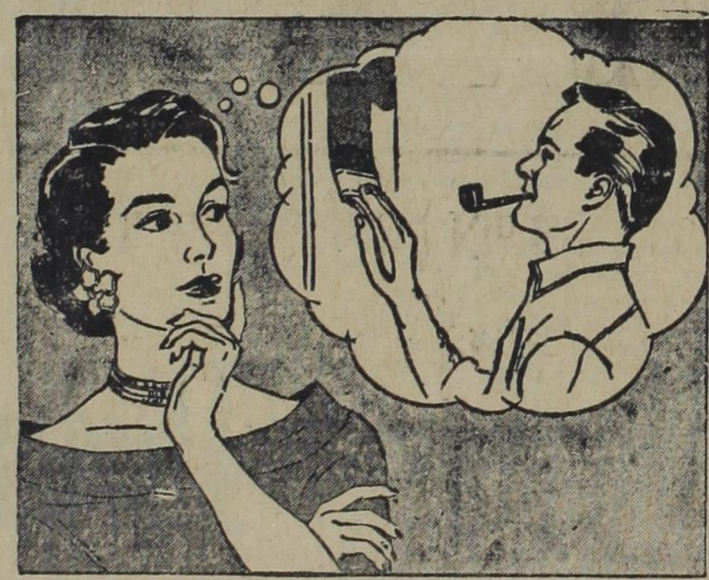
YESTERDAY a dream

For Adequate Insurance! Don't Gamble With Protection. Insurance of All Kinds!