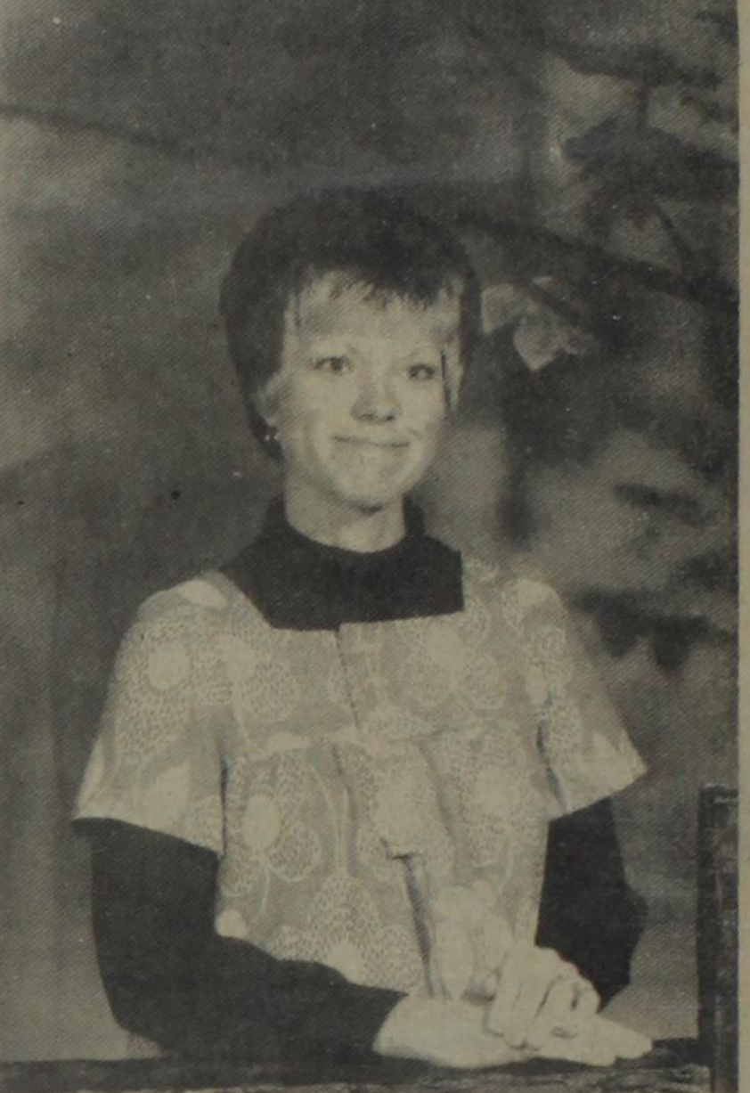
A Title Which Encompasses May Jobs

vestments in a community unless its own citizens are willing to make an investment of their own in the town's future? There are too many other places progressive in spirit. "A program such as we are contemplating to put our community utilities and other services in good condition would be a demonstration of confidence and civic spirit that could not fail to impress others who would like to come here. "But if it is done the citizens must approve it by authorizing a bond issue to be offered the FmHA or other low interest agencies of the government--in other words to be sold at the lowest rate of interest available from such agencies. "When you consider that our schools, churches, homes, businesses, etc., represent millions of dollars investment you can see how important it is that we have a community whose conditions, especially its municipal services, sustain and increase these values. Not only the values of our homes, but the very cultural values that make living here attractive and satisfying depend upon these conditions. "Your city officials have worked long and hard upon a program to bring your community out of its difficulties and make it a town in which you have pride and confidence. But it is up to the people to decide! If they say 'No', the program will go forward and we will feel well rewarded in their faith of they say 'No'--??? It is their responsibility.