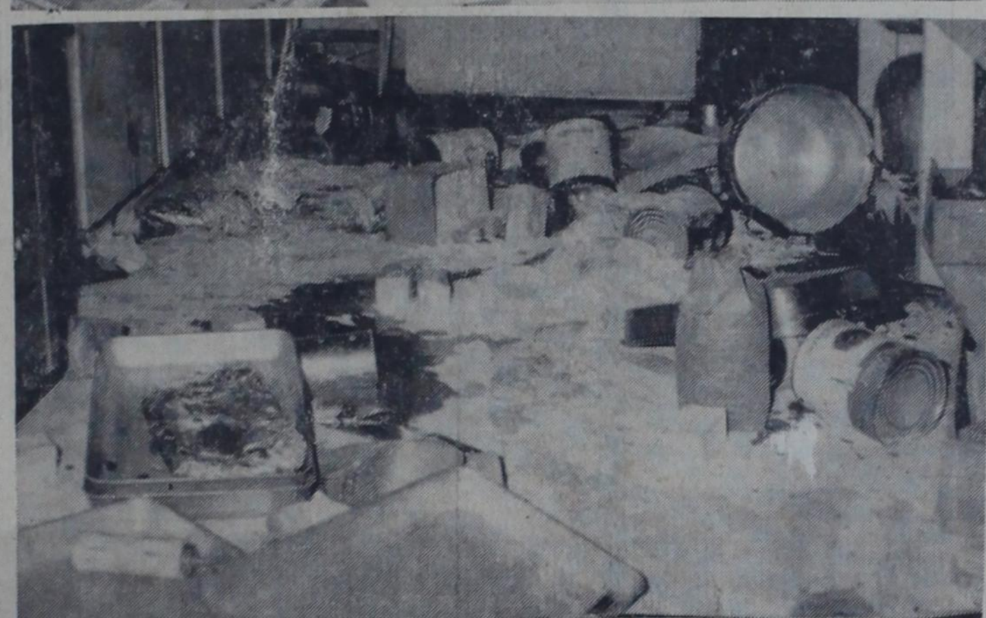
VANDALISM-These views of the Title I, remedial education room at top, and the kitchen of the Rising Star Elementary school lunchroom at bottom show the wreckage done by intruders who broke into the building through shattered windows. Fortunately, according to Supt. Victor Childers and Prin. Weldon Hill, the week or ten days, relegated damage which at first seemed great, will not run more than $1.000 unless two expensive machines cannot be repaired. The damage was discovered by members of the Eighth grade class returning from a picnic Friday afternoon. Two 10year-old boys were apprehended. Members of the class and their teachers cleared up the mess Saturday and salvaged most of what appeared lost.