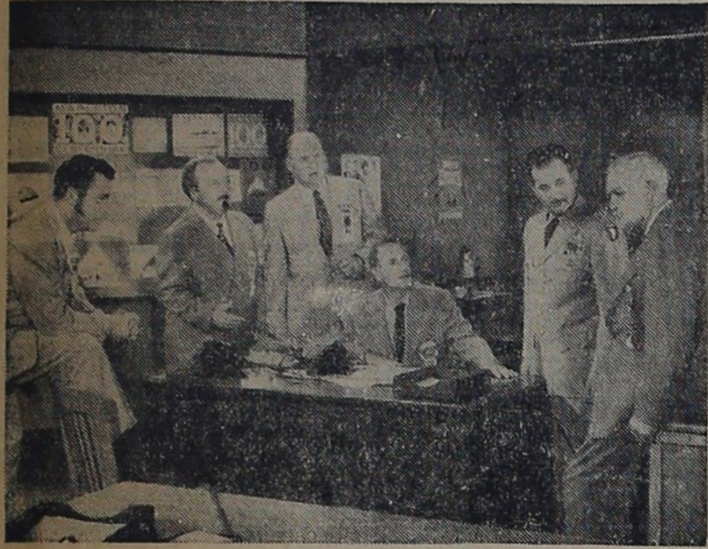
Choosing the guest of honor for the Mapleton centennial celebration provides occasion for all kinds of conflict in the picture "Mr. Christmas," feature presentation of the forthcoming John Deere Day.

"Mr. Christmas," a full-length, full-color entertainment feature, will highlight the John Deere program planned for farmers