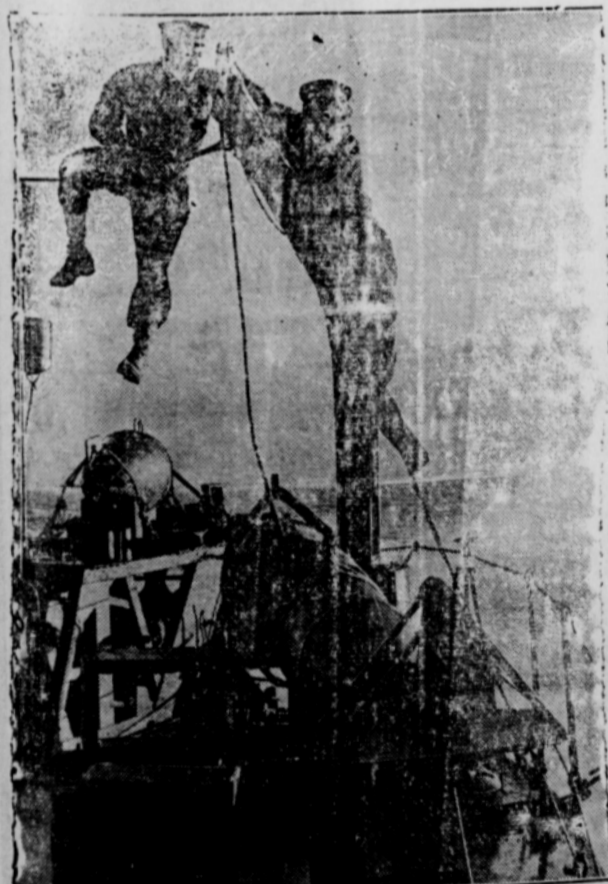
Service at sea involves all sort of odd and dangerous jobs, especially on that bucking bronco of the high seas, the destroyer. Here two Polish sailors are making a running repair on the paravane gear of their new destroyer, O.R.P. PIORUN, which was turned over to them by the British Government to take the place of a Polish vessel lost off the coast of Norway. The paravane — it's that finny, torpedo-like body in the foreground — is a hollow float which is towed along beside the destroyer to detect and snap the anchor cables of lurking mines.