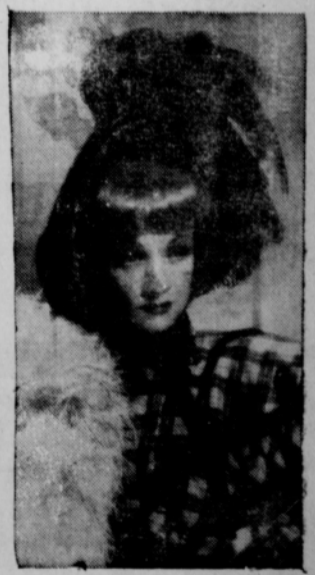
Marlene Deitrich in "The Flame of New Orleans" a romantic comedy showing Friday and Saturday at the Rialto in Brownfield.