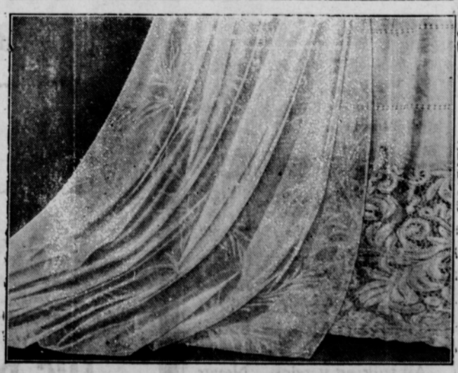
One of 1941's Smart New Lace Net Curtains Contrasted with the First One Made in America

MODERN, prettily sheer lace net curtains like the pattern at the left will be chosen for decorative effectiveness by today's bride. But elegance in her great-grandmother's day was expressed by heavier, more ornate styles such as the curtain on the right, which is a piece of one of the first lace net curtains made in the United States way back in the early 1880's. While three generations of brides have been growing up, the textures day's finer, lighter lace net curtains.