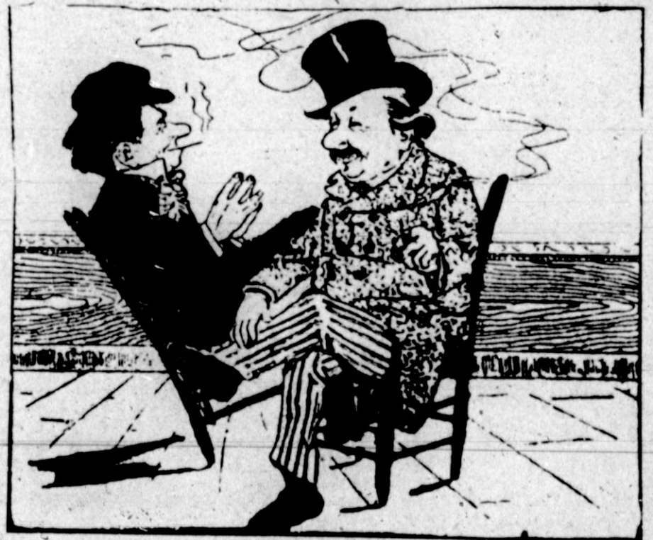
YES, I FEEL GOOD!