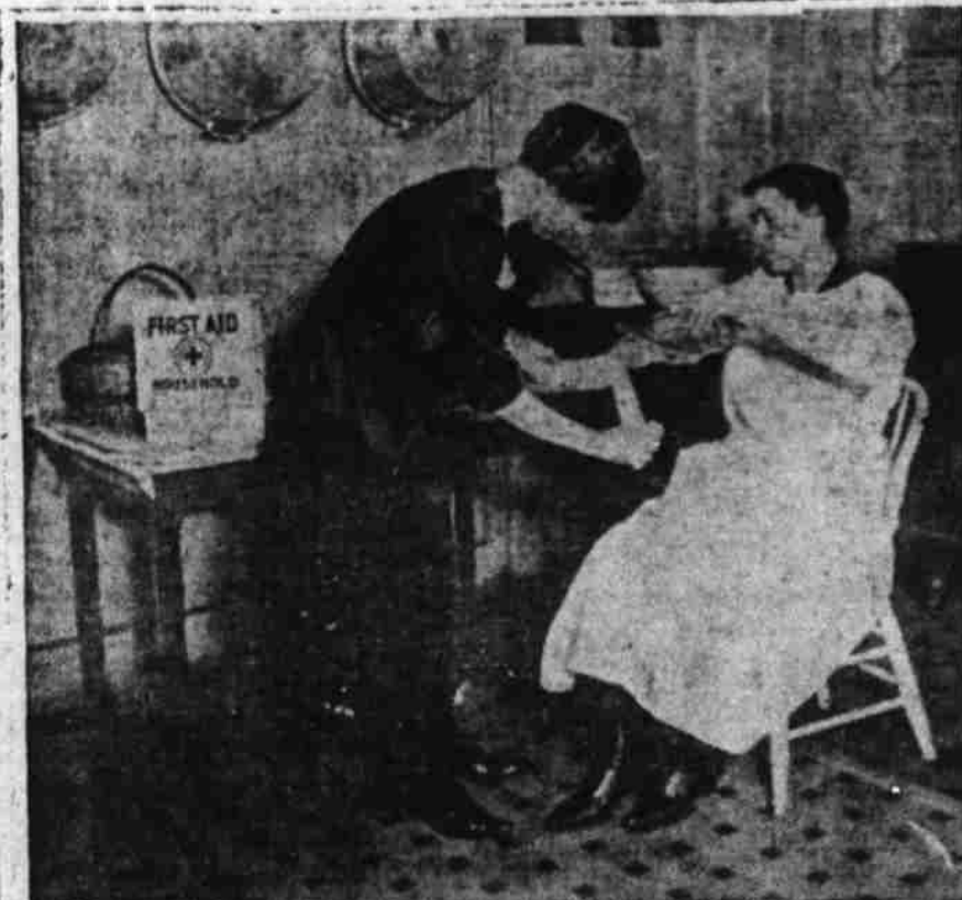
Practical example of the use of First Aid in accidents as taught by the Red Cross. The picture shows assistance being given a housewife who has been severely burned while cooking.