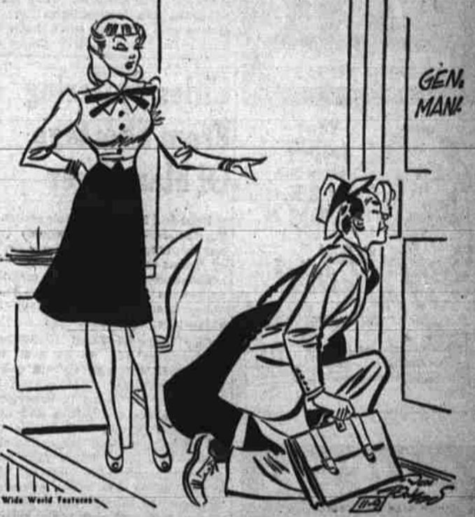
"You can see for yourself he's in conference."

Trademark Registered U. S. Patent Office