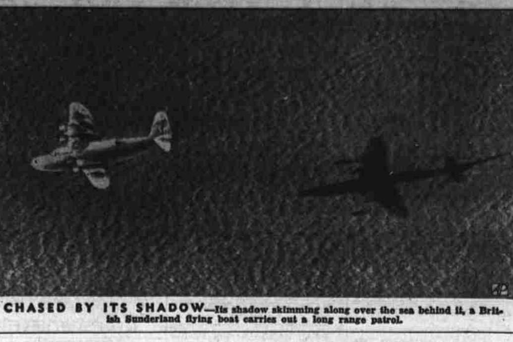
CHASED BY ITS SHADOW—Its shadow shimmering along over the sea behind it, a British Sunderland flying boat carries out a long range patrol.