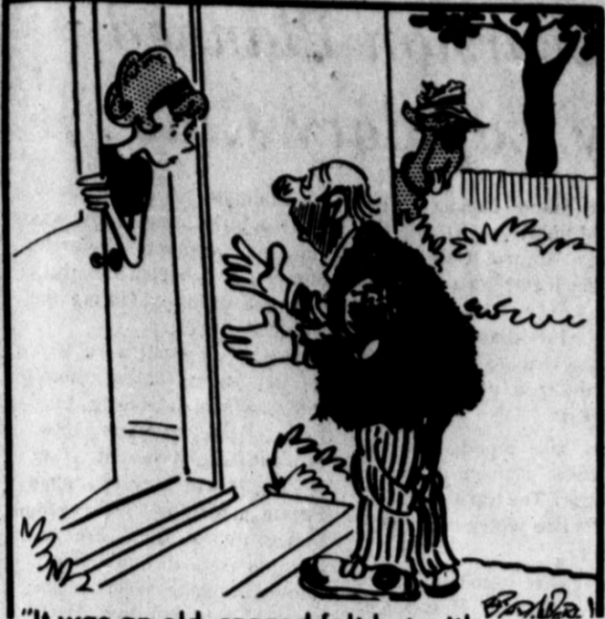
"It was an old, ragged felt hat with holes in the top."