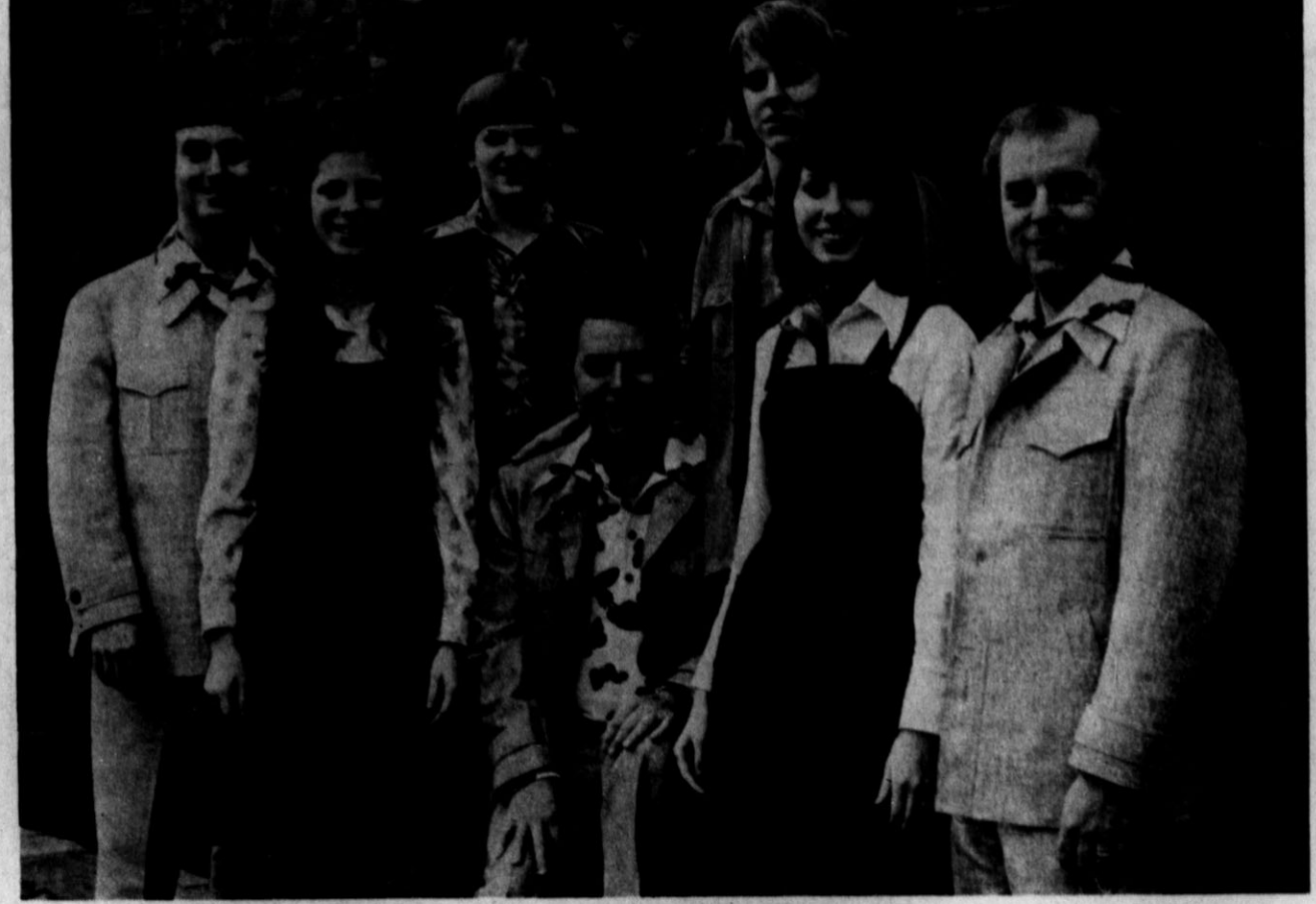
GOSPEL SINGING WESTERN AIRES ....to perform here

"Now therefore, I, James H. Sears, by virtue of the authority vested in me as Mayor of the City of Hereford, in the State of Texas, do hereby proclaim the week of Sept. 17-23, 1976, as Constitution Week, in the City of Hereford and urge all our citizens to pay special attention this week to our Federal Constitution and the advantages of American citizenship."