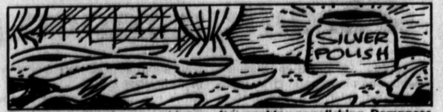
Don't store silver for several hours after washing or polishing. Dampness can cause black spots.

Moviegoers are fickle — but some stars to manage to stay near the top for two years running.