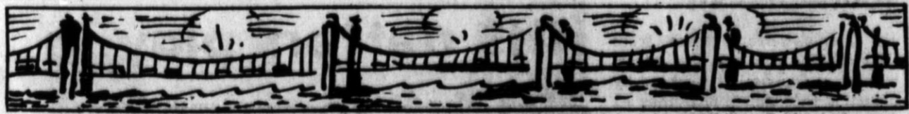
When it is completed, the world's longest suspension bridge will be the 5,840-foot Akashi Kaikyo Bridge in Japan.