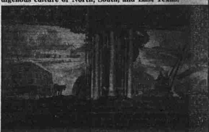
Cotton and lumber development, with the slumbering force of oil still in the earth, depict economic progress in one of the East Texas room's stylized murals,