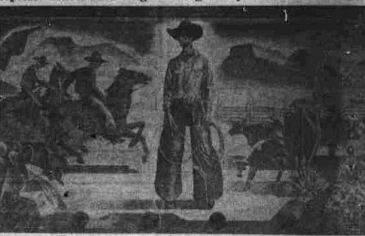
The sun-bronzed cavalier of the plains. The West Text room honors the cowboy, as other exhibit halls portray it digenous culture of North, South, and East Texas.