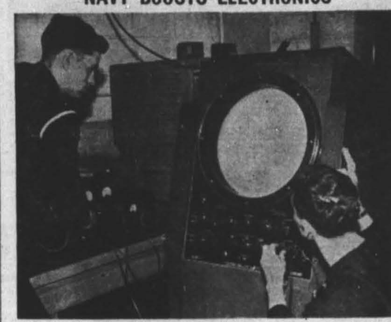
Navy Day, 1946, heralds a new step forward in the United States Navy's expansion of its electronic development program, which is designed to equip it as a guardian in Peace, just as electronic progress enabled it to emerge a victor in War. The Bureau of Naval Personnel has announced that, beginning November 4, 1946, the basic course of Electronic Technicians' Mates and Aviation Electronic Technicians' Mates will be broadened from 38 to 42 weeks under a program aimed at filling 7,900 billets now open in these ratings. There are more than 3,700 different types of modern, complex electronic equipment aboard ships of the Fleet, in Navy planes and at shore stations. Photo shows advanced students at the ETM school in Anacostia, Washington, D. C., using an oscilloscope, a device for demonstrating the functioning of electronic equipment.