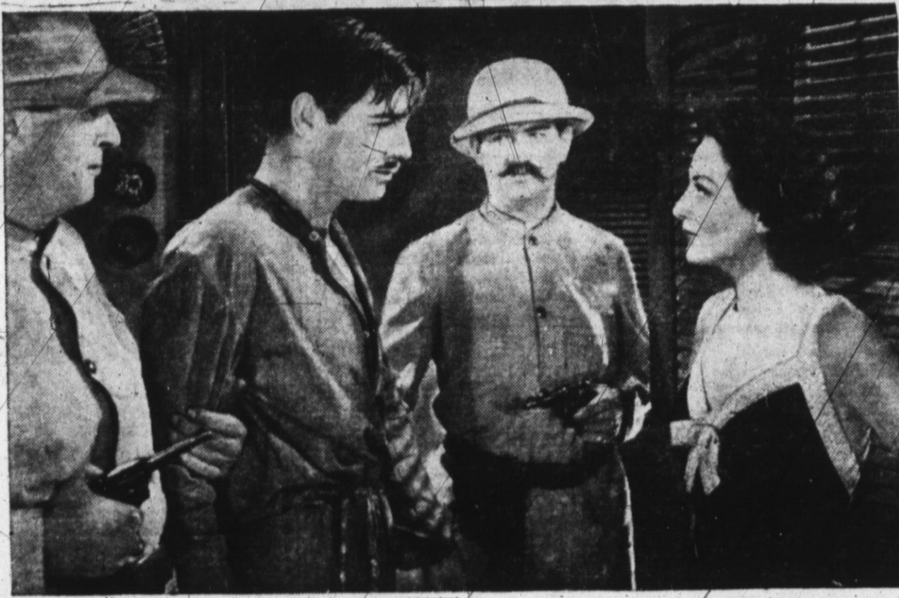
HE-MAN CLARK GABLE and the tempestuous Joan Crawford are starred in this story of the tropics which comes to the Star Theatre Sunday and Monday, March 3 and 4.