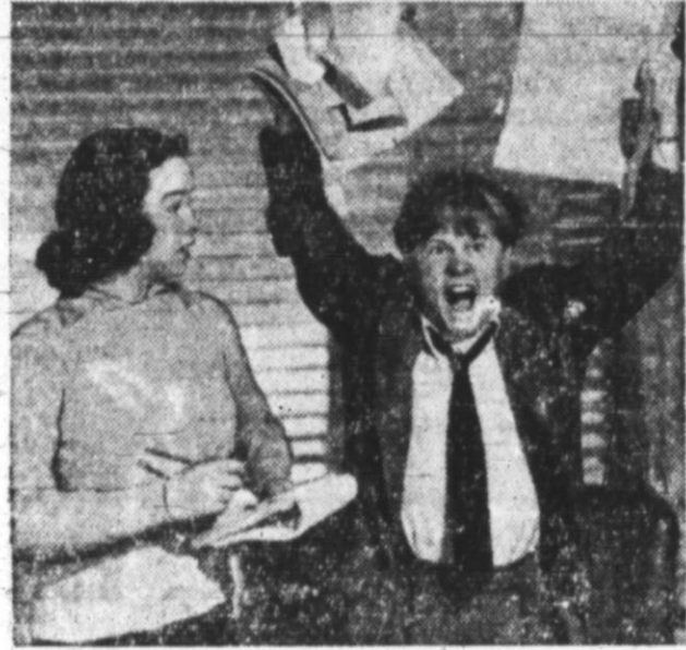
It's a terrific idea! Hold everything!