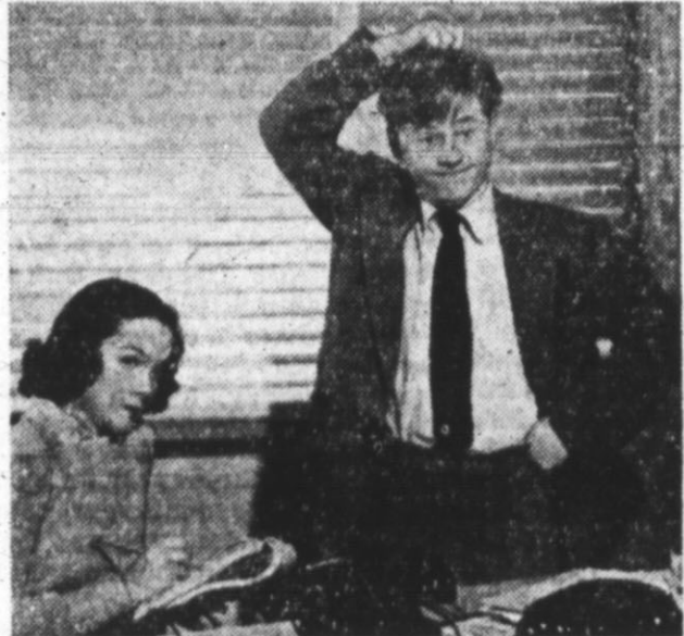
Where do we go from here? Mickey aids the thinking process with a mild scalp massage.