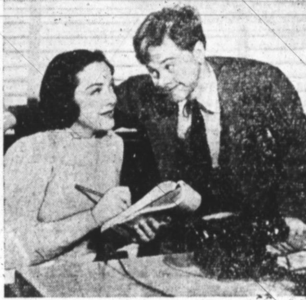
"How's about going to lunch with me?"

Mickey Rooney gets his first taste of business as class president, treasurer, and what have you in the new Hardy Family production, "Andy Hardy's Private Secretary," which shows at the Star Theatre Sunday and Monday. With him is a newcomer to the popular Hardy clan, Kathryn Grayson, who plays the part of the secretary. The new film is reportedly one of the best of the Hardy series.