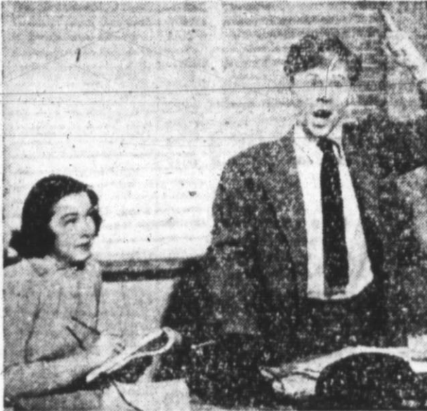
Whoops... an idea! Picture of a young executive about to start dictating.