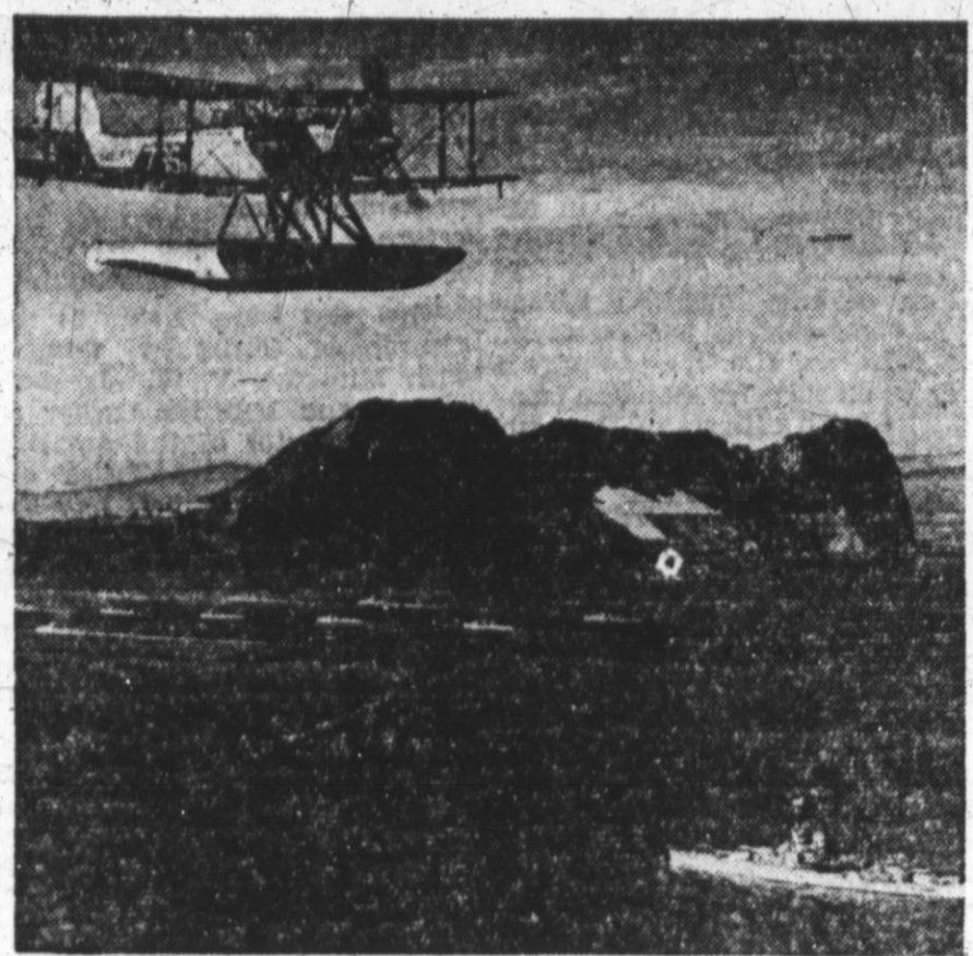
A view from an accompanying British war plane high above Great Britain's Rock of Gibraltar, showing another plane on patrol duty, winging high over the harbor, wherein are several men o' war. All are on the alert against attack by German planes from the air and German troops that might be given a "corridor" down to southern Spain by the Fascist government. The Rock, which is one of the most formidable fortresses in the world, is Great Britain's effective western door to the Mediterranean, through which British commerce and warships flow from day to day.