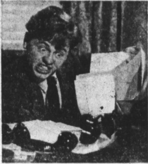
What's to do about it? Mickey Rooney's affairs are more confused than European war dispatches.