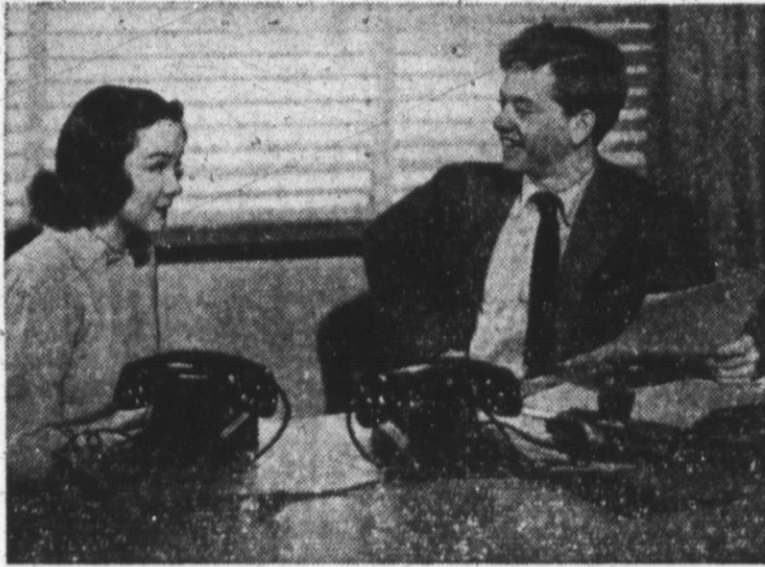
Ah! Just what the doctor ordered! A private secretary, and cute, too! She's Kathryn Grayson.