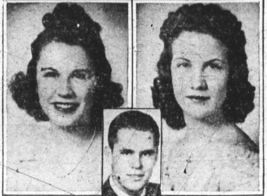
TISDALE HALL MAYO