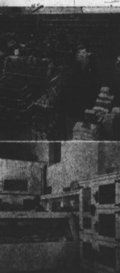
Here are interior views of Weir's Super Market which will hold its grand opening Saturday.