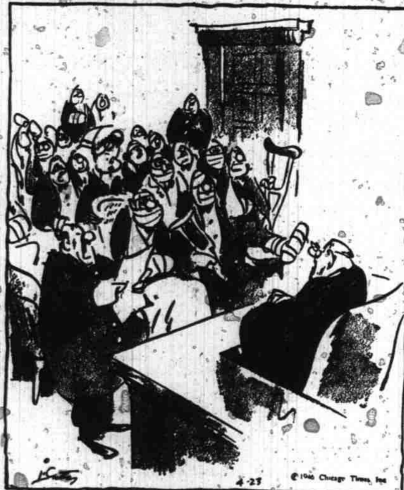
The next case, your honor—the people versus the Roadside Eye Catcher Billboard Co.