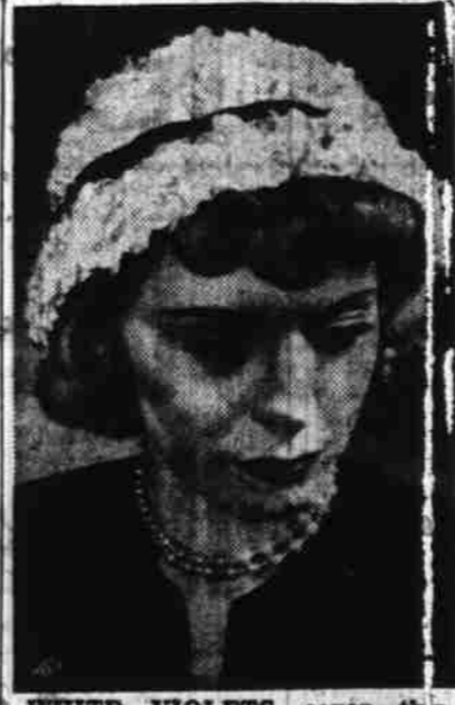
WHITE VIOLETS cover the youthful small cloche known as "Little Bobbie."