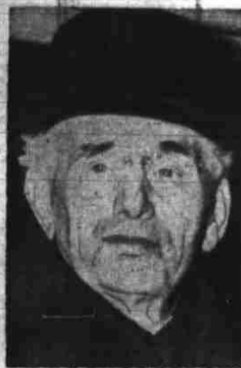
Eighty-two-year-old Louis D. Brandeis, associate justice of the supreme court, is shown as he returned home after his first appearance in court following a month's illness.