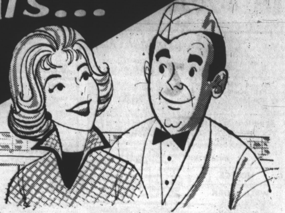
Copr. G. Doppel 1963