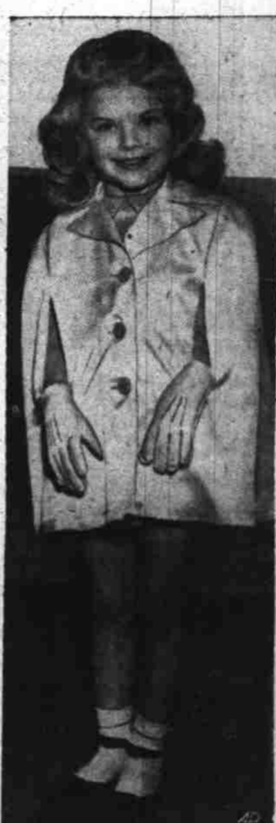
PARTY GIRL... Rain can't keep her at home. Her pastel satin rain cape is dressed-up enough for any junior glamor girl... Water repellent, too.

In relieving the discomfort of children's simple chest colds by using Durham's Nu-Mo-Rub, the modern Guaiacol-Camphor chest rub. Doctors agree that its 29% Guaiacol-Camphor formula is a decided improvement over Mother's old-fashioned Eucalyptus style rubs.