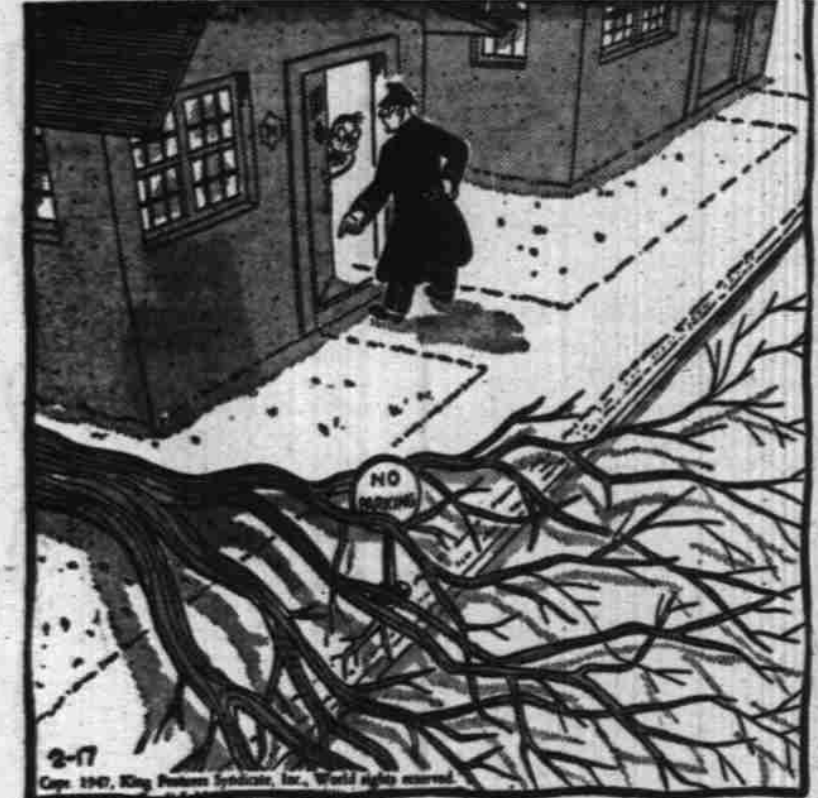
"You'll hafta remove that fallen tree—no motorists can see that sign!"