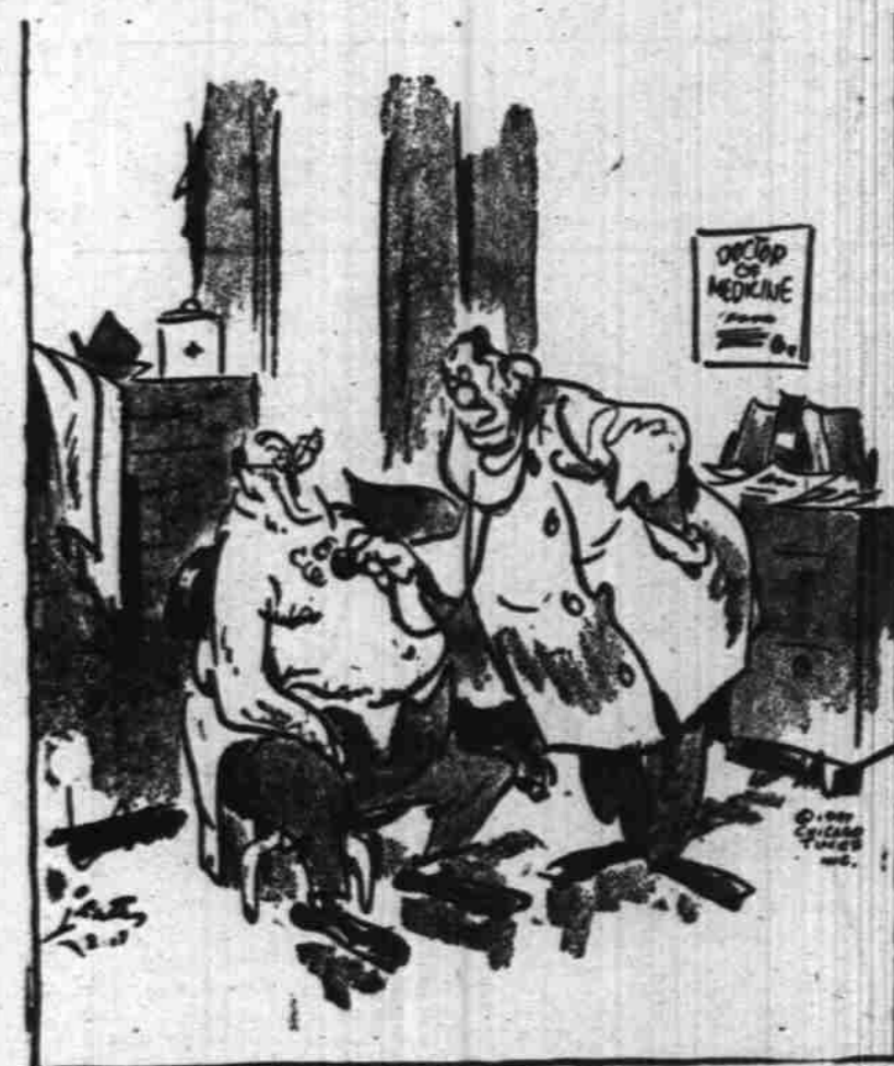
"Why should anything be wrong with me—I have listening to the radio for years and I'm full of medically tested ingredients!"