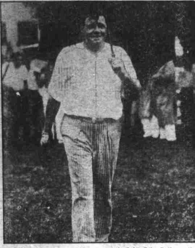
Rain no longer means "No game today" for Babe Ruth, onetime sultan of swat. Here he's shown shouldering an umbrella as he played golf at Westchester Country club. After scoring an 81 despite unfoverable weather, he said he might attempt to qualify for the national cour tourney. (According Green Bhotal