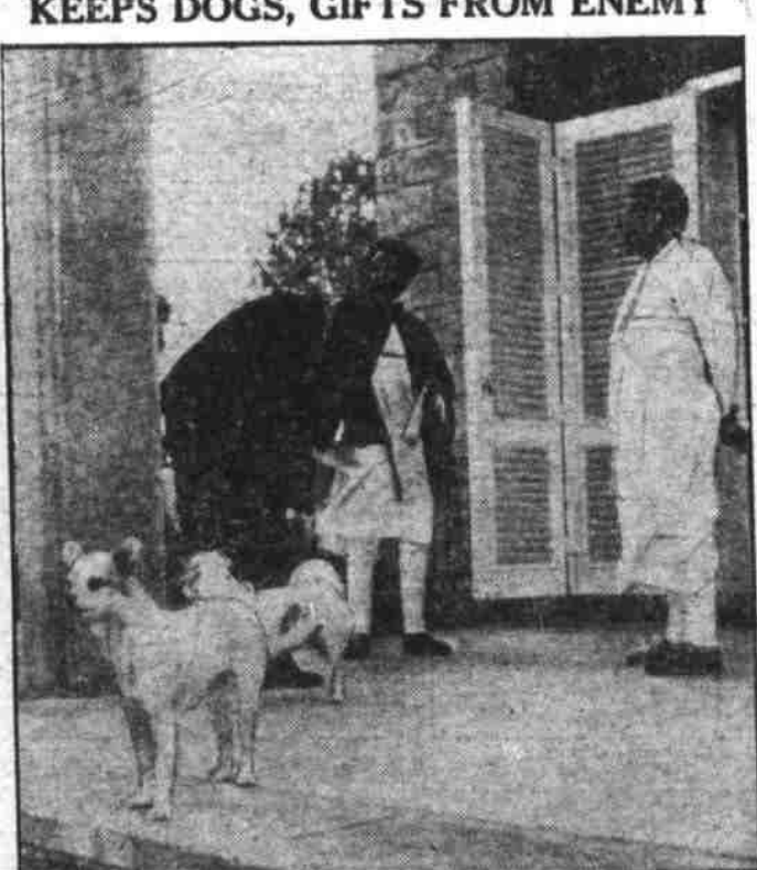
Italian residents of Ethiopia were moving out, but these Italian dogs—gifts from the King of Italy to Emperor Haile Selassie in happier days—will remain. The remains shown in front of his palace