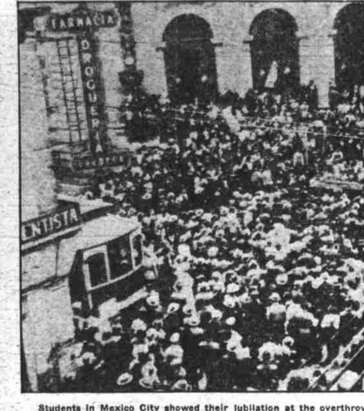
Students in Mexico City showed their Jubilation at the overthrow of the 11-year dictator of Tabasco, Tomas Garrido Canabal, whose control came to an end with the removal of Governor Lastra by President Cardenas. In this celebration traffic was blocked while students paraded with a casket containing an effigy of the dictator, which later was hanged to a light pole.