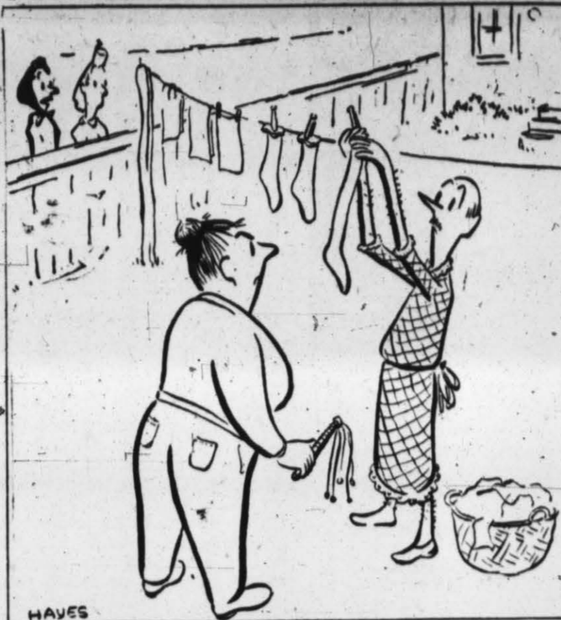
"You can certainly tell who wears the pants in that house."