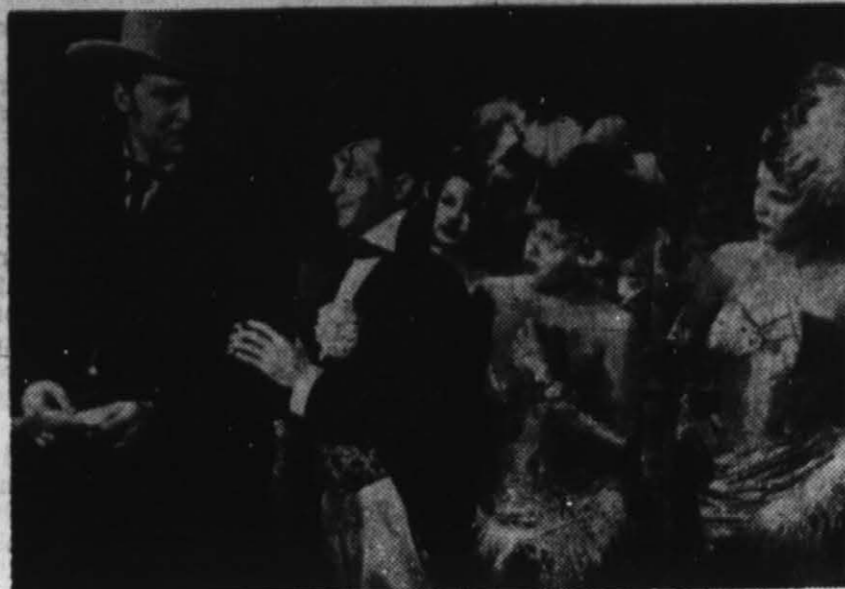
DODGE CITY — the toughest town in Kansas, is the scene of "The Woman of the Town," a western to which "something new has been added." Claire Trevor is a church-going dance hall girl and Albert Dekker plays the part of the famous Bat Masterson, marshal of Dodge City. The picture is the week-end feature at the Texas.