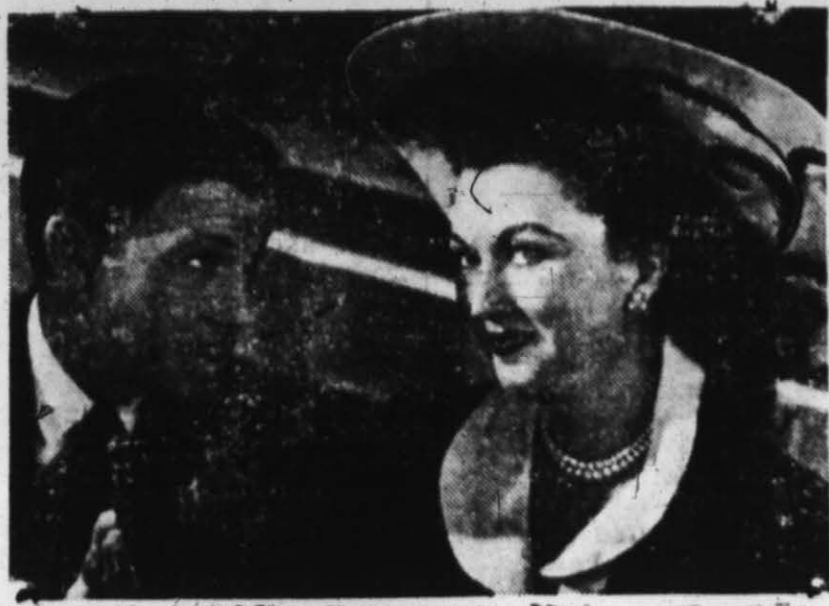
GINNY SIMMS and GEORGE MURPHY are co-starred in the romantic musical, "Broadway Rhythm," which also features Charles Winninger and Gloria DeHaven, Rochester, Hazel Scott, Lena Horne and Tommy Dorsey and his orchestra. It's the Sunday, Monday and Tuesday feature at the Star.