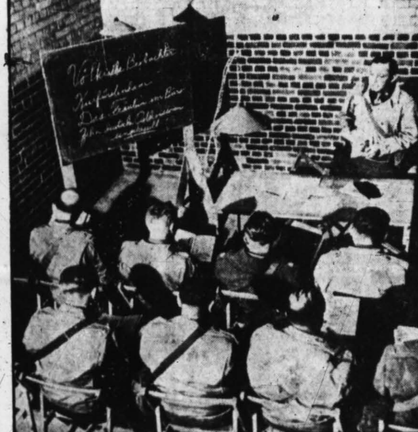
Here is a group of the men who follow our invasion forces: American and British civil affairs officers and men hand-picked for knowledge of law, public health, civil administration...