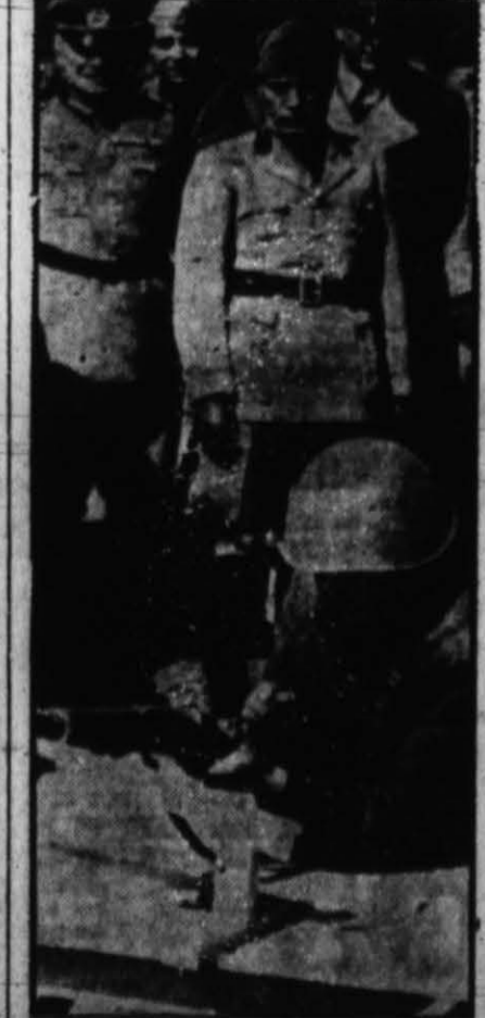
Somewhat thinner than of old, Mussolini still wears his bulldog look as he pauses to watch a still-loyal Fascist do his stuff during a review in Northern Italy. This picture comes via a neutral source.