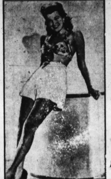
Brooklyn-born Trudy Marshall, formerly a model and cover girl, looks mighty, mighty choice, and you can see more of her soon for she's in Hollywood now, her first role being in "Ladies in Washington"