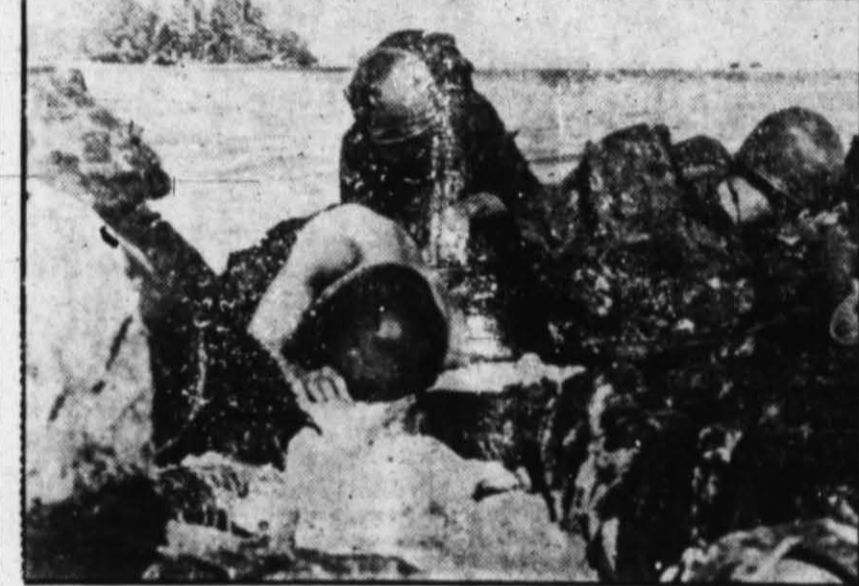
An American trooper is shown administering to a comrade struck down by Jap bullets while breasting the surf in the initial landing at Wakde, Dutch New Guinea. The casualty was held up and pulled ashore by soldiers around him, who are shown, left and right, flattened to the beach to escape the fusillade. Only the first aid man's head is up. He's risking death to keep the wounded man alive.