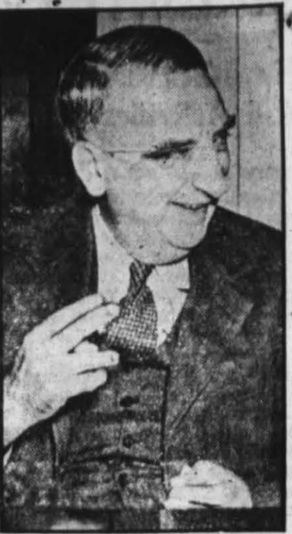
Fred M. Vinson, new Director of War Mobilization and Reconversion, smilingly makes a point before the Senate Finance Committee. Vinson, a Kentuckian and former judge, succeeded James F. Byrnes.

ent in the Senate and it began its official business.