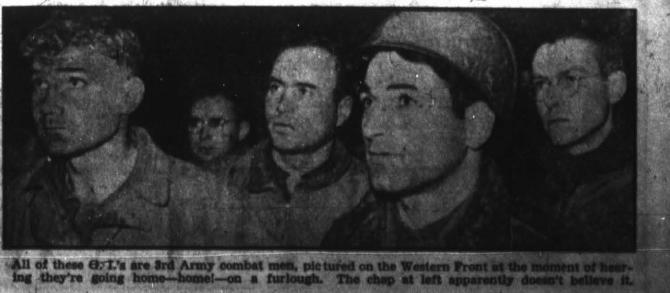
All of these G. I.'s are 3rd Army combat men, pictured on the Western Front at the moment of hearing they're going home—home!—on a furlough. The chap at left apparently doesn't believe it.

Even though a person did not earn enough in 1944 to be liable for income tax, he should file a return if he had any wages from which withholdings were made. That is the only way he can obtain a rebate of the tax withheld.