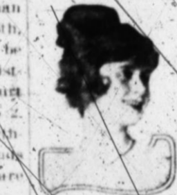
Miss Billie Burke