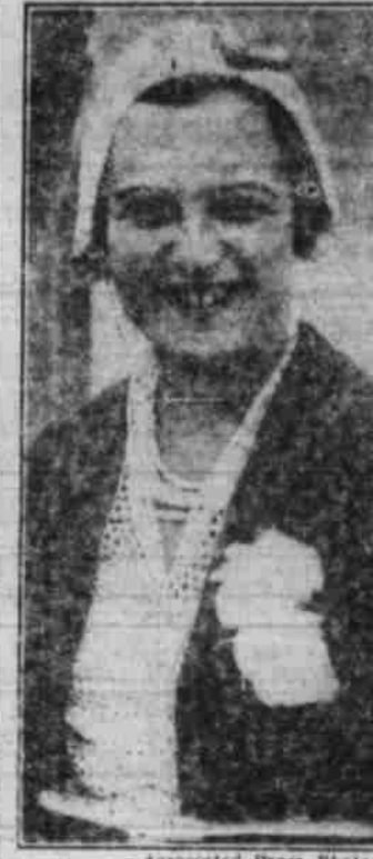
Betty Nuthall, British tennis star, shown as she arrived in New York City. She will compete in Wightman cup matches and defend her American singles crown at Forest Hills, N. Y.