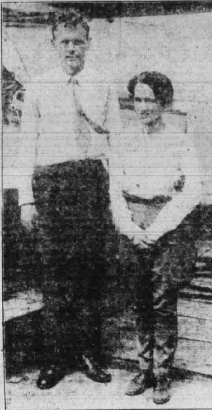
Here are Col. and Mrs. Charles A. Lindbergh standing in front of their plane as they started their vacation flight to the Orient. The air tour covering 7,100 miles from New York to the Orient will be made in leisurely stages.