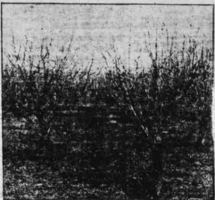
Grasshoppers have played havoc with crops in several midwest and northwest states, and this picture shows how the plague has stripped leaves and fruit from trees in an apple orchard near Lucas, S. D.