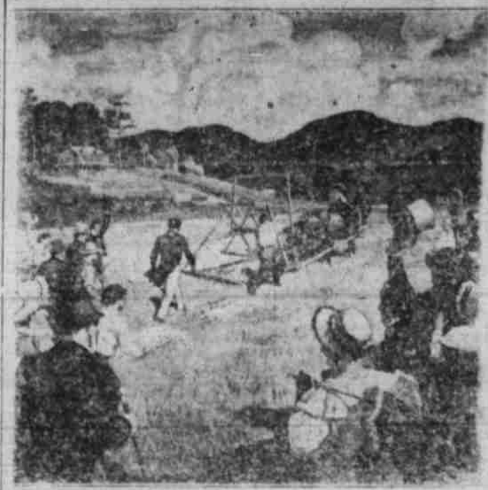
An authentic reproduction of the scene 100 years ago when Cyrus Hall McCormick operated the first reaper. In observance of the 100th anniversary of his invention J & W Fisher will entertain throughout Monday and Monday evening for farmers of the Big Spring country and the people of Big Spring.

The scores and exhibits will be open until 9 p. m. Monday and the motion picture performance will be repeated in the evening for the general public, farmers as well as all others.