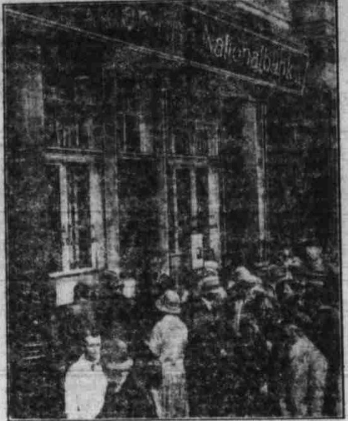
An excited crowd in front of one of Germany's greatest banks, the Darmstadt and National bank, Berlin, when the institution suspended payments because of the drain on its resources by constantly rising demands for foreign currencies. The collapse of the bank seriously weakened Germany's already strained financial and economic structure.