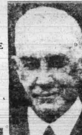
Henry P. Fletcher will retire September 10 from his post as chairman of the tariff commission.