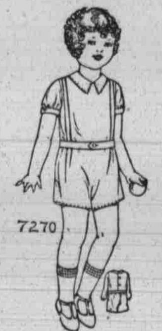
A PRACTICAL PLAY GARMENT

7270. This pleasing and comfortable style is cut in one piece in front, and with waist and body portions joined with buttons under a belt at the back. The sleeve may be made in wrist length, with a hand cuff, or in short puff effect, finished with a sleeve band. Pique, pongee, percale and other cotton prints may be used.