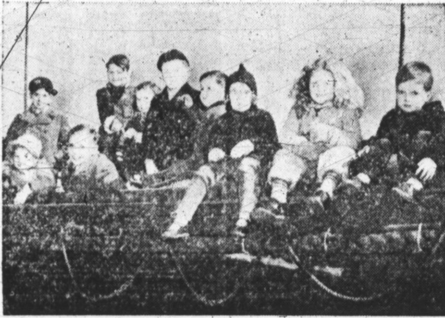
These British children were assigned to this lifeboat on the S. S. Georgic during its hazardous journey to New York. When the steamship docked the children used the boat, which was to be their watery home in case of torpedoing, as a sort of playroom. The Georgic was the first British passenger ship to dock in New York since November 18, 1940.