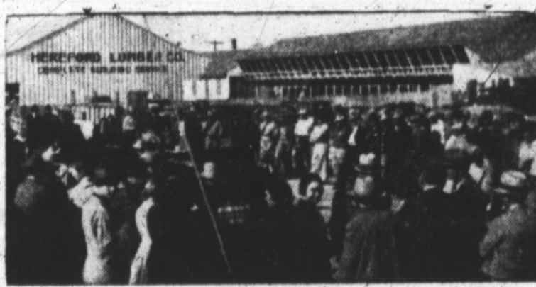
Above Picture was taken at the 4-H and FFA Stock Show here in 1940.