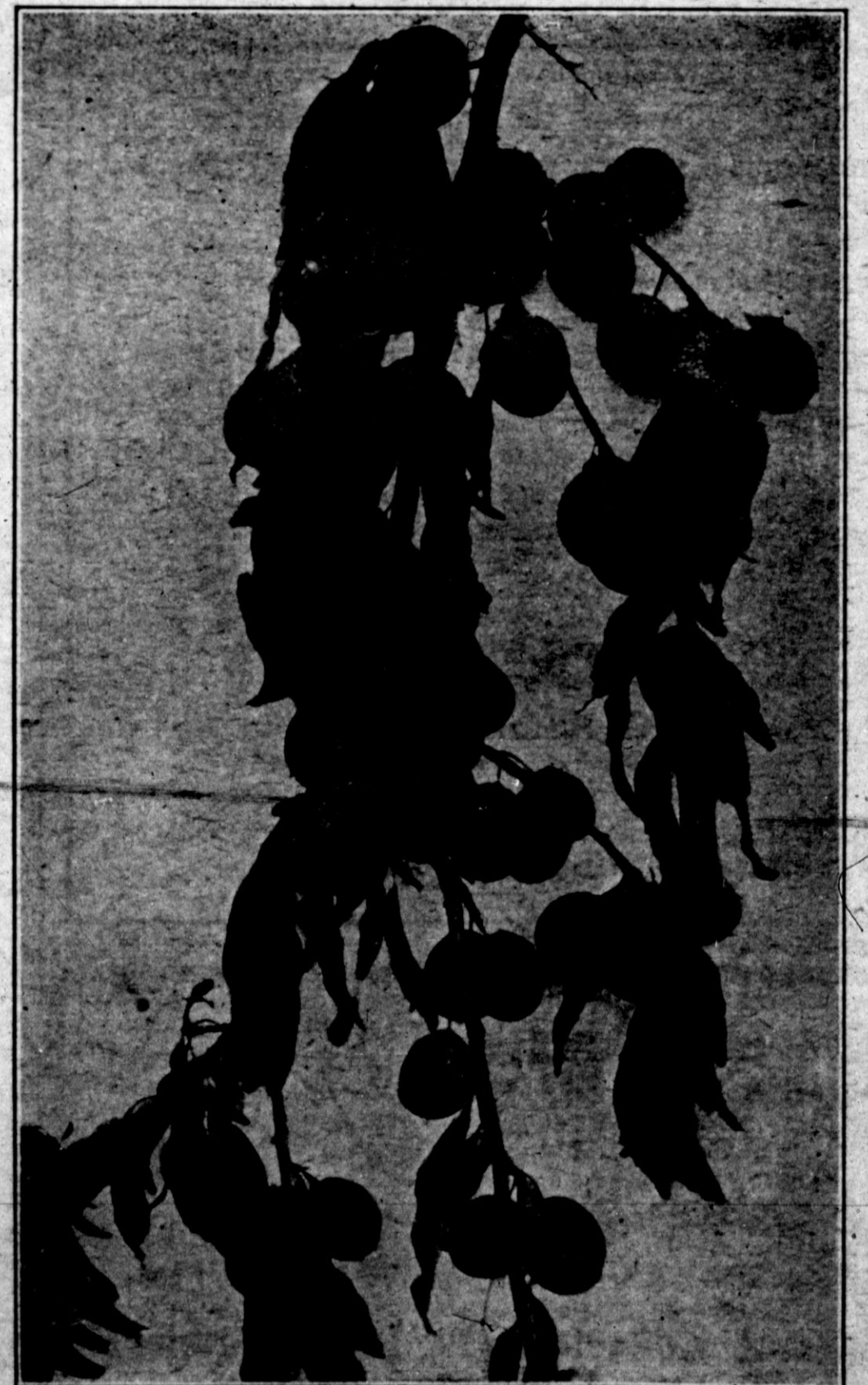
FORTY-FIVE PLUMS ON AN 8-INCH LIMB—Grown in