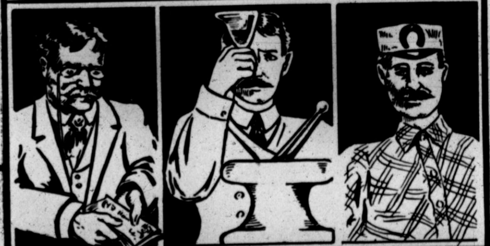
CONSUMER CHEMIST PAINTER