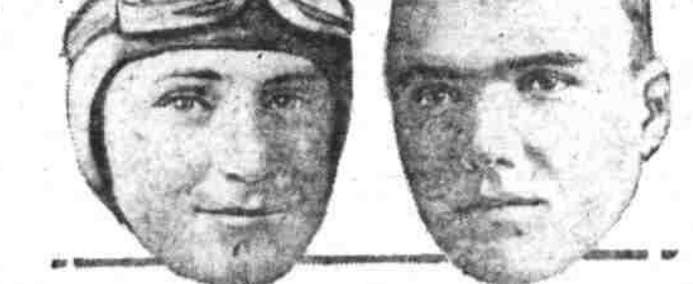
Here are two pairs of American aviators who may take part in a non-stop race of 4,400 miles across the Pacific from Tokyo, Japan, to Seattle. One team shown above is composed of Clyde Pangborn (left) and Hugh Herndon. The other plane will be piloted by two Californians, C. A. Allen (left) and Don Moyle.