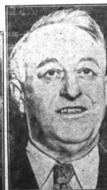
Trial of J. C. (Jack) Walton, former governor of Oklahoma, and 18 others charged with using the mails to defraud has been set for Sept. 17.