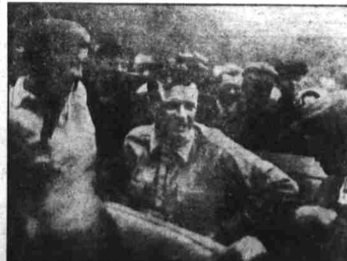
Even though the flying Lindberghs arrived in Petropavlovsk on a Sunday—when Russians work just as on any other day—they received a rousing welcome. Mrs. Lindbergh (left) and Colonel Lindbergh (seated in car) are shown being escorted to the town hall, where formal ceremonies were held.