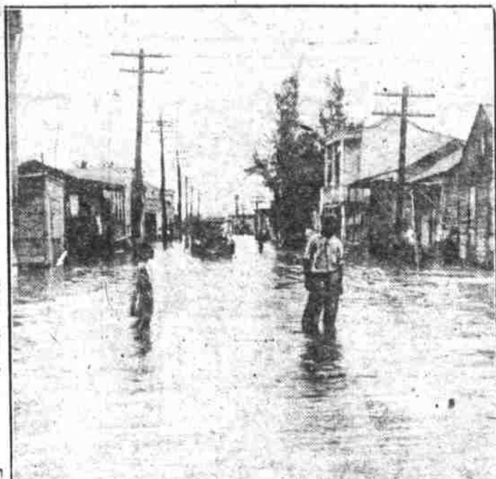
A street scene in Ponce, Porto Rico, following a disastrous flood in which 200 persons were believed to have drowned when rivers, filled to capacity by a downpour of rain, overflowed their banks. Many houses and nuts were carried into the Caribbean sea by the deluge.