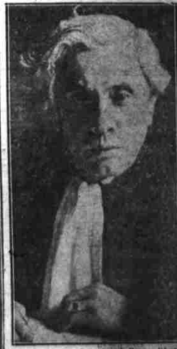
Joseph Paul-Boncour, foreign affairs chairman of French chamber of deputies, proposes that armed forces of every nation be placed at disposal of league of nations to put down wars of aggression.