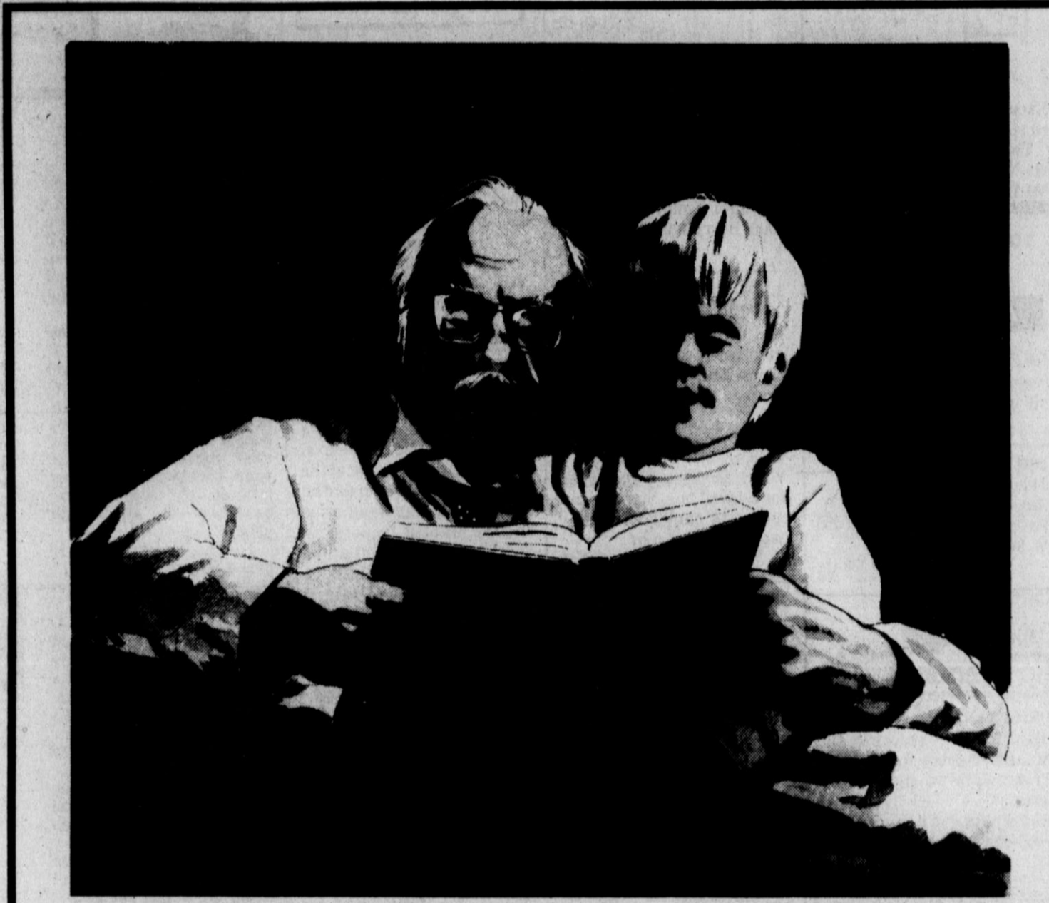
FAITH TEACHES RESPECT FOR A GRANDFATHER'S WISDOM