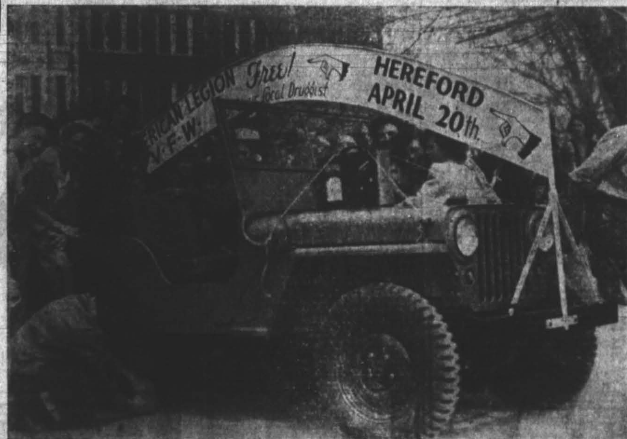
A group of Teen-Towners inspect the new Army Jeep... the successor to the Model T... which will be given away by Hereford War Veterans on X-Day April 20.