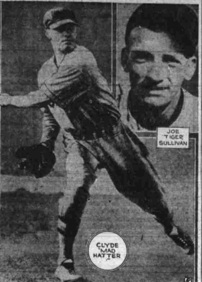
The Detroit Tigers, who could have used a winning left-hander earlier to advantage last season, hope either one or both these lads qualify for the 1935 campaign.