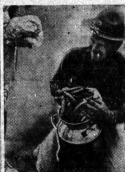
Falling like manna from heaven, food for a platoon of cavalry in maneuvers at Valentine, Texas, was dropped by plane. The men were fed for four days by this means as a test of the efficacy of rationing military units by air. Here are delighted troopers with the supplies which were dropped to them from the air.

approaching the street protected by such slow signs or signals to extent necessary for such vehicle to safely enter or cross the street so protected.