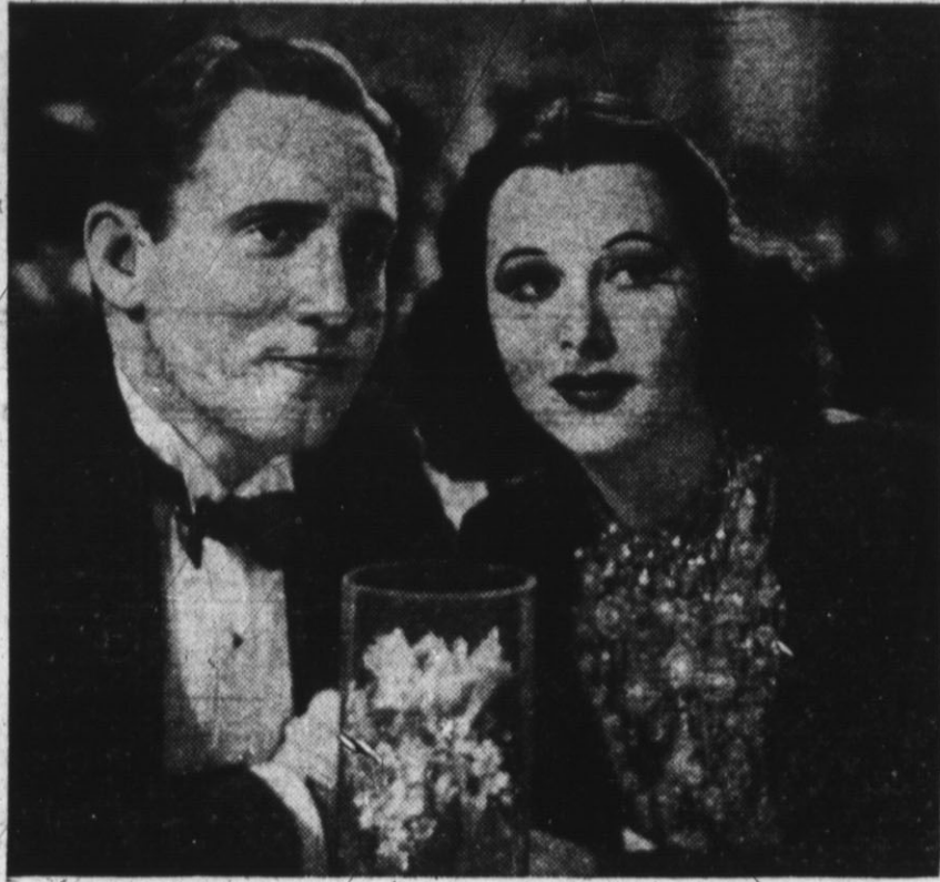
THIS COUPLE, academy-award winner Spencer Tracy and glamorous Hedy Lamarr, in "I Take This Woman" reach a new high in screen entertainment. This show comes to the Star Theatre Sunday and Monday, March 10 and 11.