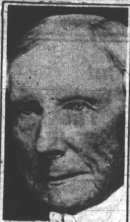
This is a new, exclusive and one of the few posed portraits of John D. Rockefeller, reputed the world's richest man and founder of the Standard Oil Company.